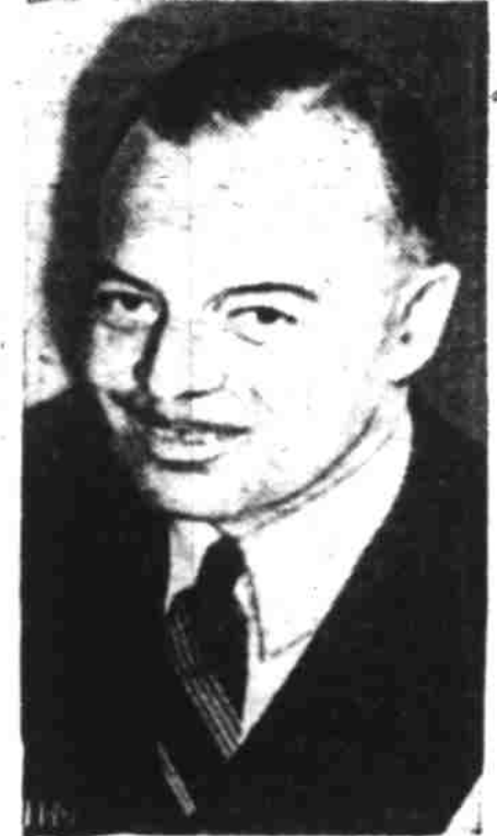
Harold E. Stassen