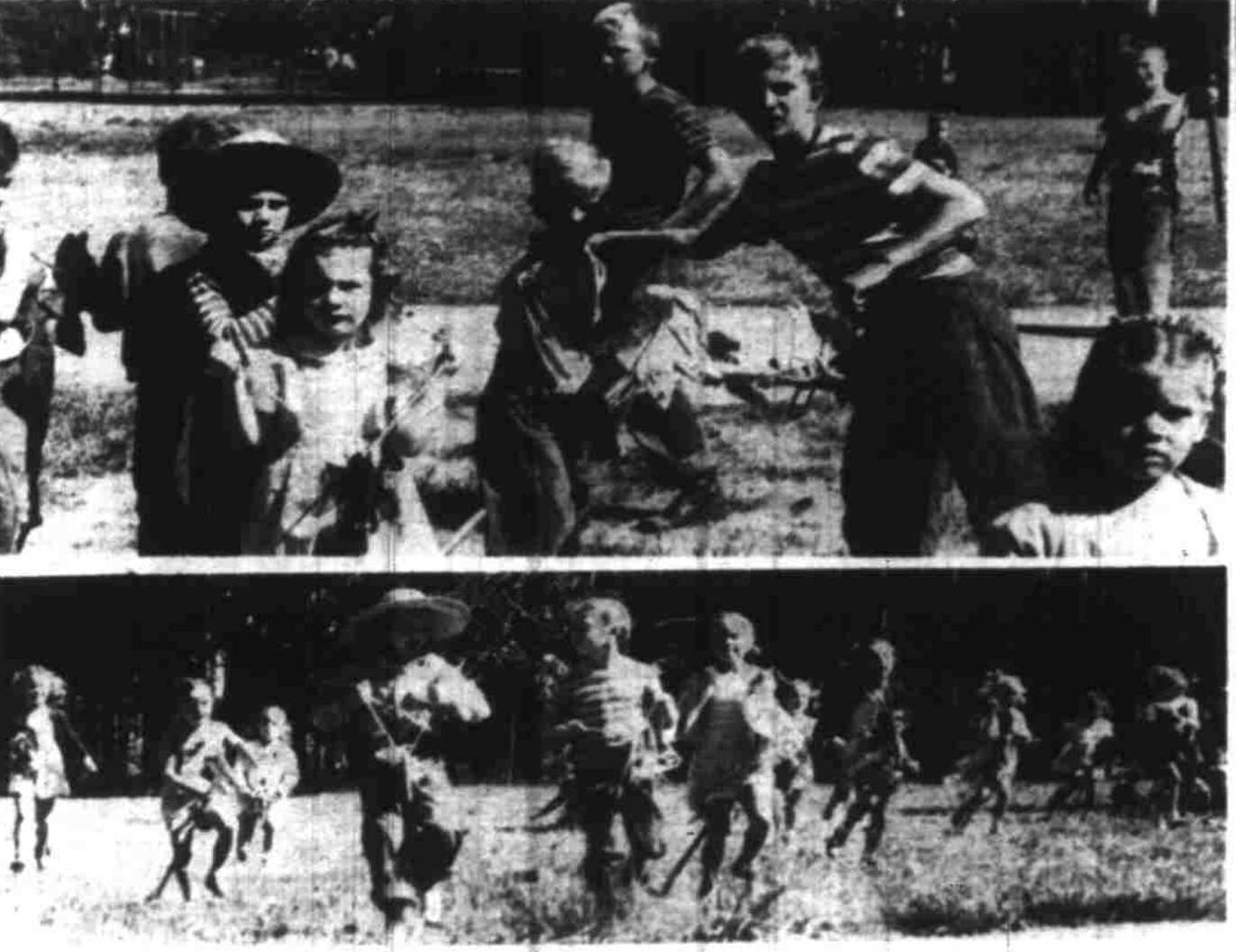
HOBBY-HORSE DAY, an annual event at Englewood playground, was held Friday with more than 100 children entered in the racing.