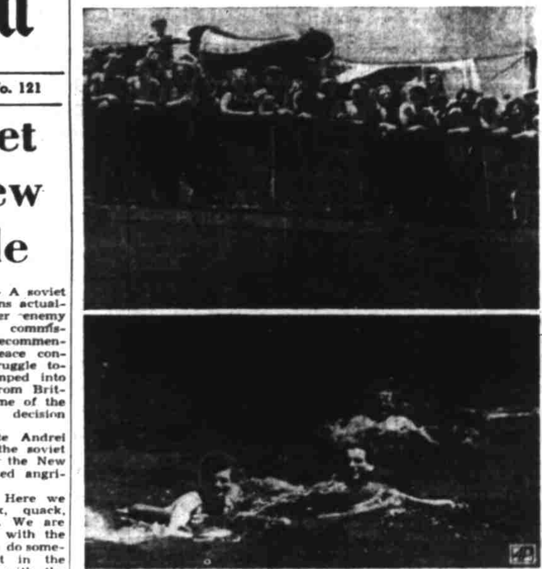
HAIFA, Aug. 16—Before their hope of entering Palestine was blasted by the British order deporting them to Cyprus, Jewish immigrants line the rail (above) of a ship in Haifa harbor and watch other refugees swimming along the side of the ship (below).