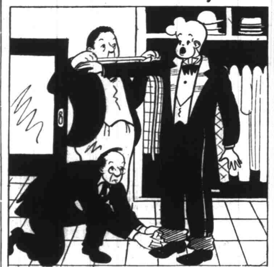
"I s'pose this get-up will require a change in my decorum!"