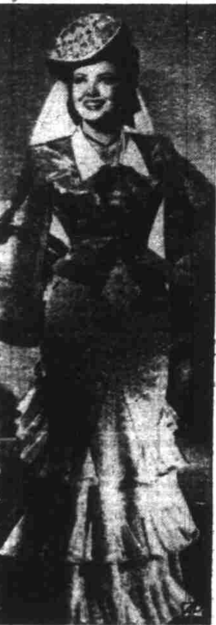
FRILLY —Linda Darnell of the films poses in a fancy costume of the period of Philadelphia's 1876 centennial.