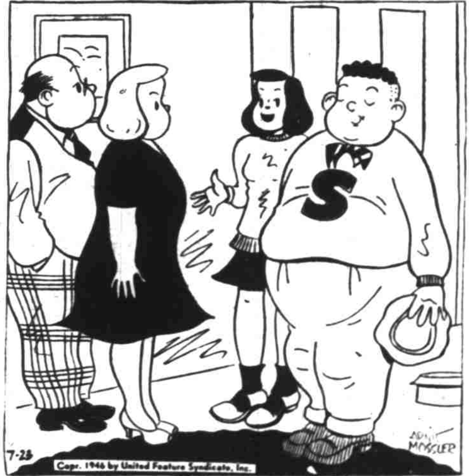
"This is Roger—I'm dating him for the pie-eating contest."