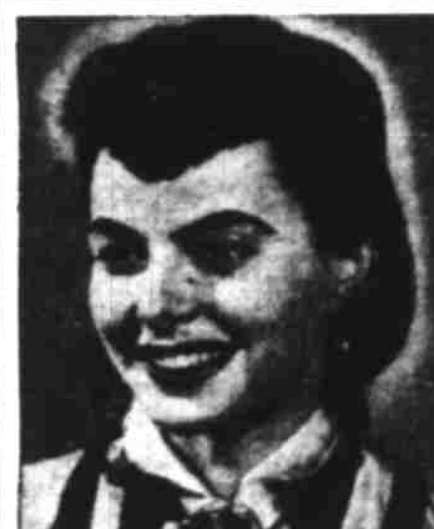
Ingrid Bergman who co-stars with Gary Cooper in Warner's "Saratoga Trunk." Starts today at Warners' Capitol theatre.

Whist is the ancestor of bridge. The Pasteur experiments began in 1856.