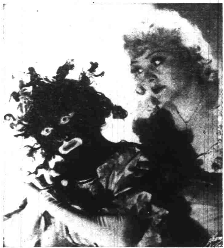
The Duncan Sisters, internationally famous comedienne, who will appear in their noted Topsy and Eva act at Leonard's Supper club for one week starting Monday.