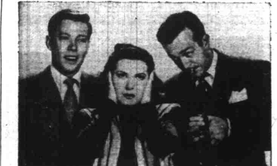
Maureen O'Hara has a difficult time deciding between the singing of Dick Haymes and the trumpet playing of Harry James in "Do You Love Me?" starting today at Warners' Elsinore theatre.