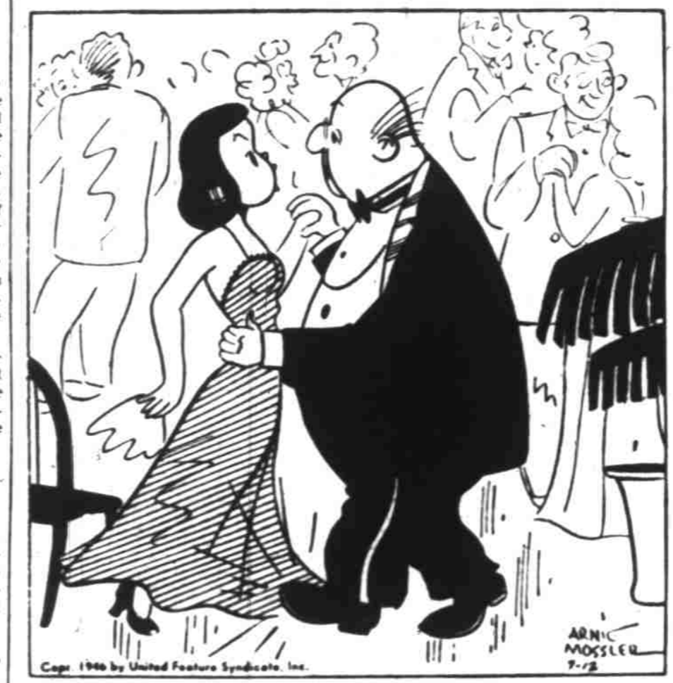
"May I cut out?"