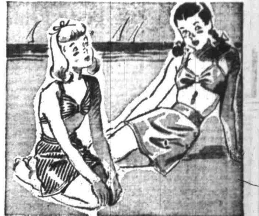
GIRLS' 2-PC. SUITS 3.59 FOR THE FOURTH

Spectacular as a skyrocket are Wards two-piece cotton playsuits for the sub-teen crowd. There's a hint of south-of-the border in the ruffles on cap sleeves, around the low neckline. Sun-back and buttoned-back styles. Shorts have front pleats for added flare, a back pocket to hold spare hankies. Bright flowers flourish on rose, powder blue, aqua and red. 7 to 14.