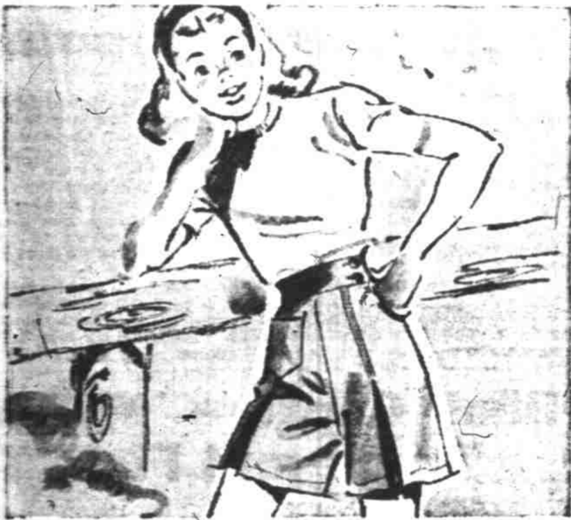
FRONT PLEAT SHORTS 1.98 FOR SUMMER PLAYTIME

S-H-O-R-T-S spells summertime to carefree 7-14's. Tailored of fine quality mercerized cotton twill, Ward's neat shorts are rated "super." Two pleats in front for extra flare . . . extra activity! Speedy side zipper closing for quick changes. Patch pocket keeps hankies and pocket money under control. Tubbable? Of course! It's smart to have several pairs.