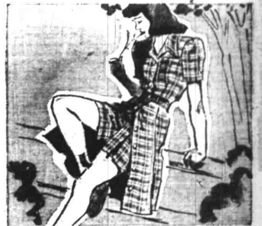
IT'S A PLAYSUIT! AND 3.89 IT LOOKS LIKE A DRESS!

Cheery wide-awake looking little casuals to lighten your heart and add sparkle to your gay summer cottons! Fashioned in soft pliable leathers—one in bright red studded with shining gold-colored nail-heads . . . the other in a cool-looking snow white with a distinctive, comfortable T-strap! Both have the popular wedge heels and smart open toes. See Wards selection now!