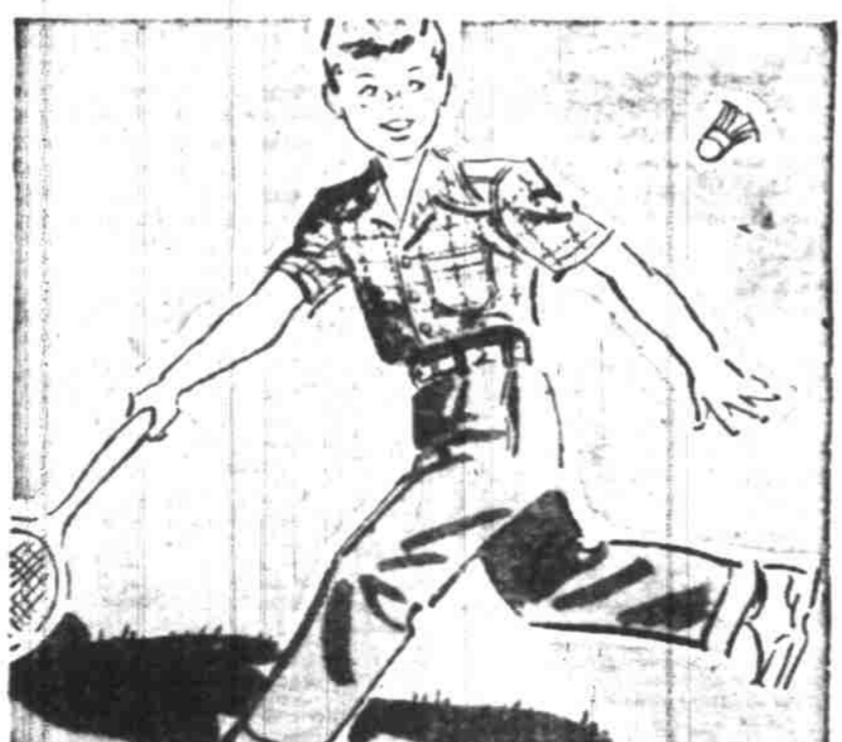
BOYS' WASHABLE 2.98 COTTON SLACKSUIT

Make this a playsuit summer for your youngest. Abbreviated little suits with bib-tops, crossed straps are so much easier to launder than dresses. Some are crinkly cotton crepe that requires no ironing at all! Others are crisply tailored cotton twill. Piquant ruffles, embroidery trim, appliques and rickrack have been cleverly used. Assorted colors. 1-3, 3-6X. At Ward-low prices.