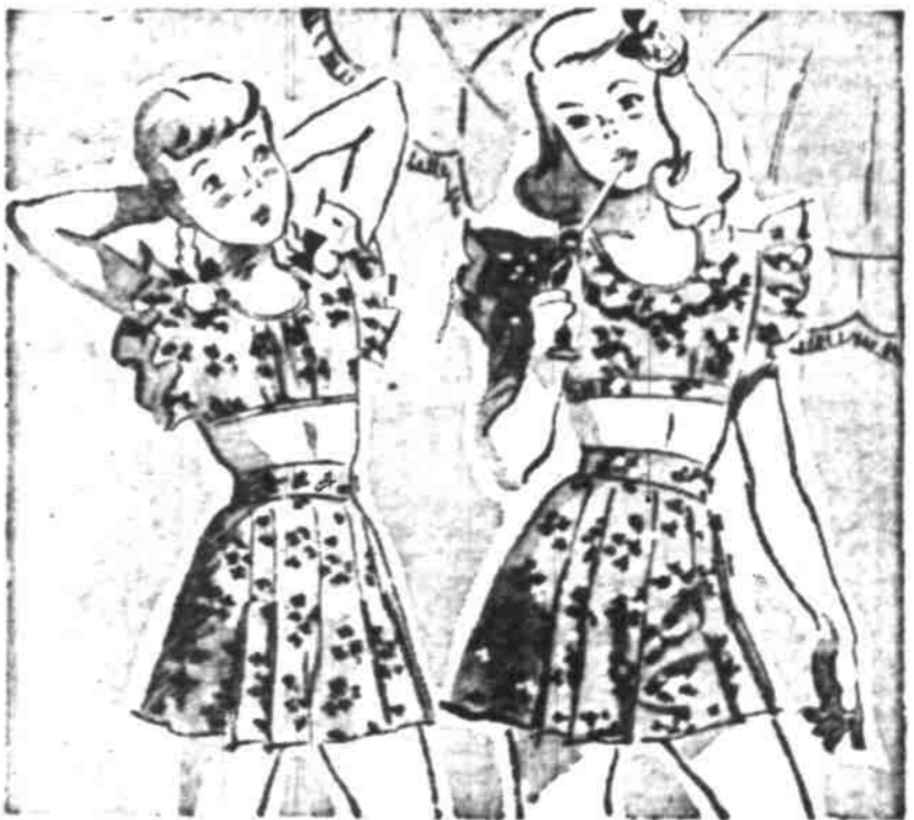
PRETTY AS A PICTURE 3.65 TWO-PIECE PLAYSUITS

Here's a slacksuit that will go over big with your 4-10 year old! He'll wear it for dress-up . . . or for baseball with the "gang" . . . yet with each washing it'll come up looking like new! The shirt, an attractive plaid . . . the pants, a sturdy cotton twill that is made for hard wear! Buy several for summer wear. They come in yellow plaid with tan, blue plaid with blue.