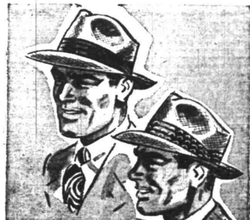
MEN, GENUINE PANAMAS 7.50 ARE COOL, AIRY, SMART

Hot weather's here already—holidays are just ahead, better get ready for both NOW with a swell new pair of swim trunks! Here at Wards we're ready for you with the finest selection you've seen—roomy boxer styles with all-around elastic waists in fine Sanforized poplins and gabardines, snug fitting all wool worsted trunks in attractive fancy knits. All have built-in supporters.