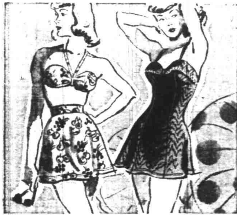
GET IN THE SWIM WITH 5.98 A NEW SUIT FROM WARDS

S-H-O-R-T-S spells summertime to carefree 7-14's. Tailored of fine quality mercerized cotton twill, Ward's neat shorts are rated "super." Two pleats in front for extra flare . . . extra activity! Speedy side zipper closing for quick changes. Patch pocket keeps hankies and pocket money under control. Tubbable? Of course! It's smart to have several pairs.