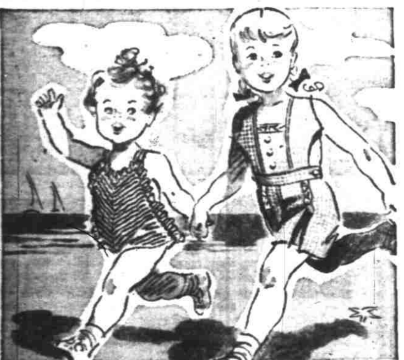
COOL, CRISP PLAYSUITS 1.45 and 2.59 FOR TOTS

Now's the time to give your wardrobe a lift with ties that reflect the brilliance and warmth of summer! At Wards you'll find the swellest selections yet—big all-over patterns in floral and geometric designs, eye-catching colors, smooth, gleaming fabrics! You'll find they're wider and longer too, and every one is bias cut—resiliently lined to knot and drape perfectly!