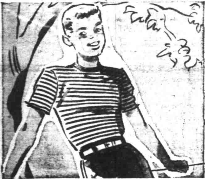
HUSKY KNIT SHIRTS ARE 1.09 IDEAL FOR ACTIVE BOYS

See, it's shorts and shirt with a smooth fitting skirt over them! The slim shorts and smart shirt are ideal for sports, and then you just put on the skirt and go right into town—or to dinner! Where to find it? At Wards, of course! We've cotton plaids, prints, stripes—in flattering styles! Don't miss them! You'll find them in Wards complete Sportswear Department! 12-18.