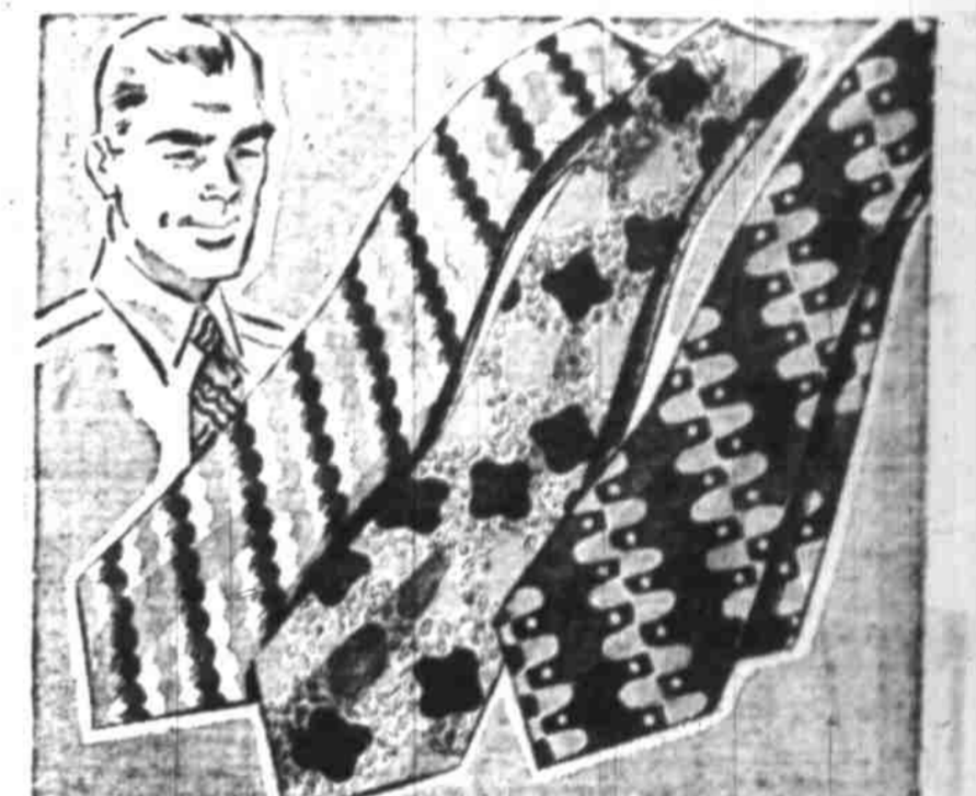
MEN'S TIES IN BRIGHT 3.19 SUMMER COLORS, STYLES

They've held the rank of top flight favorite for years—because they combine coolness with smart appearance! Every one is hand woven under water for extra flexibility and lightweight comfort! They come to you pre-blocked in the style approved pinch front design. Wide choice of colorful bands, plain or patterned, to suit your individual wardrobe. Invest in summer comfort NOW!