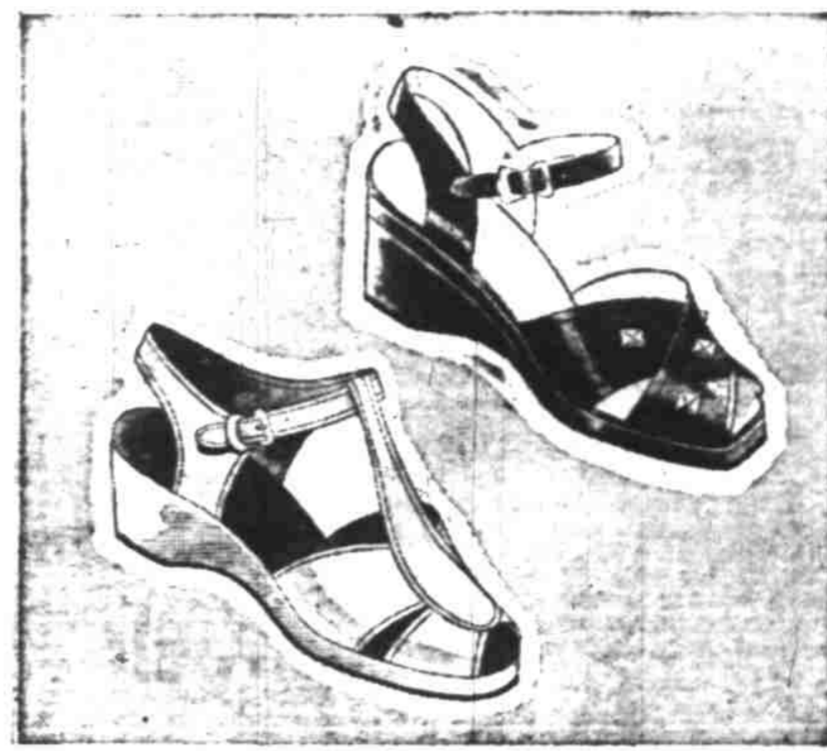
WOMEN'S SMART 3.49 ALL-LEATHER PLAYSHOES

Proud of your swim stroke and love the water? Then, see Wards smooth fitting, sleekly styled one piece suits. And for soaking up the sun, what's better than one of the new brief two-piece versions? We've gay cottons, sleek rayons! Colorful prints as well as solid colors! And every size 32 to 40! Yes, a trip to Wards—first—is the smart way to a wonderful week-end outing.