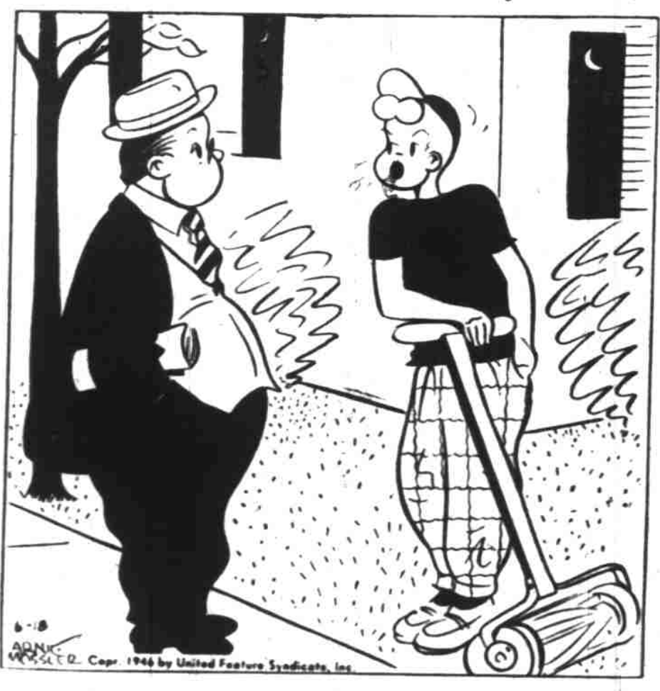
"I think it's about time capital got together with labor, pop!"