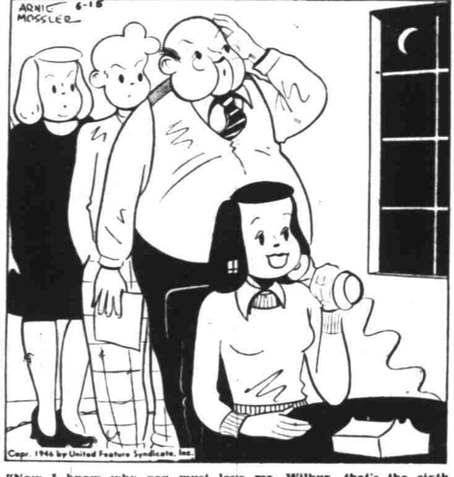
Now I know why you must love me, Wilbur—that's the sixth nickel you've deposited!