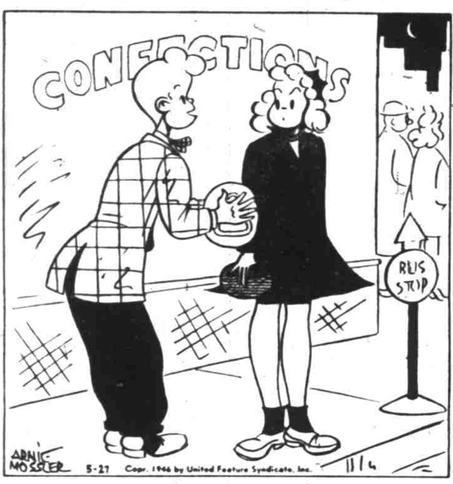
"Pardon me, my name's Young. Would you care to neck?"