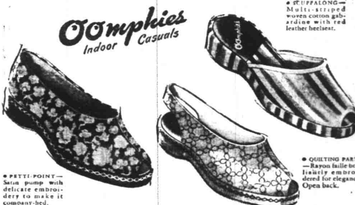
• PETIT POINT—Satin pump with delicate embroidery to make it company-bed.

A tailored Oomphe to work about the house—a petit point pump for an informal hostess—a quilted casual for a dozen duties—Mister, you've made a hit when you give her a wardrobe of OOMPHIES! They're the Indoor Casuals she's always wanted—prettier, smarter, cushioned in comfort.