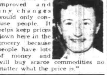
Portrait of a woman, likely related to the obituary or news item.