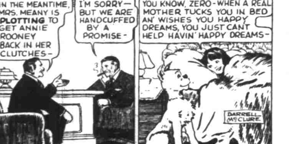
THE YOUNG IDEA