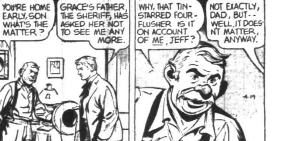
THE YOUNG IDEA