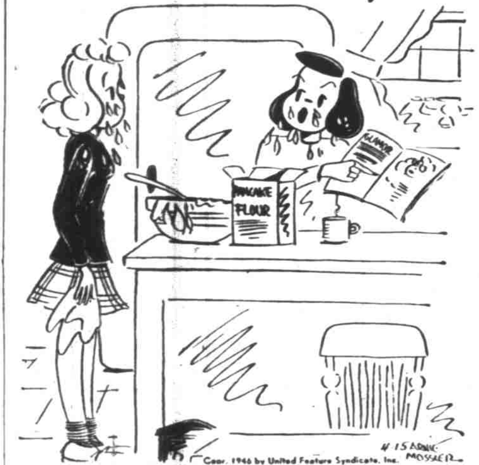
"It says right here that the glamorous stars use pancake make-up!"