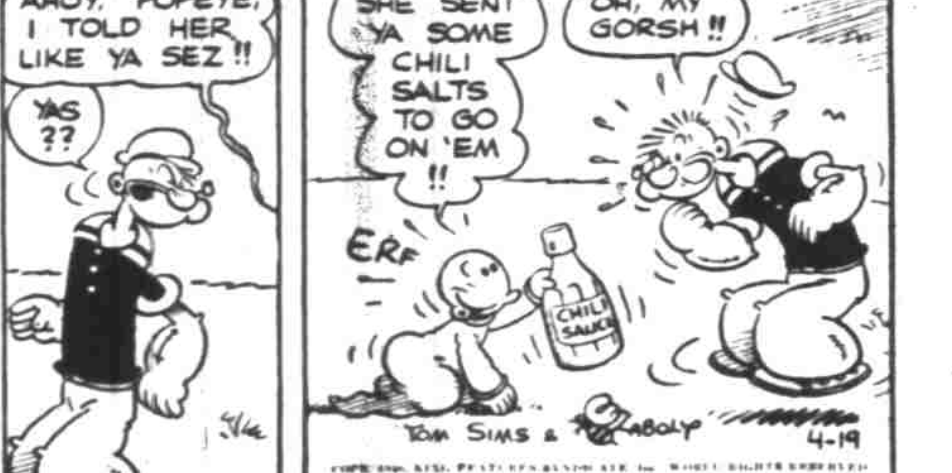
THE YOUNG IDEA