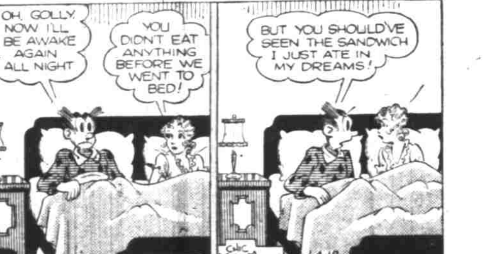
THE YOUNG IDEA