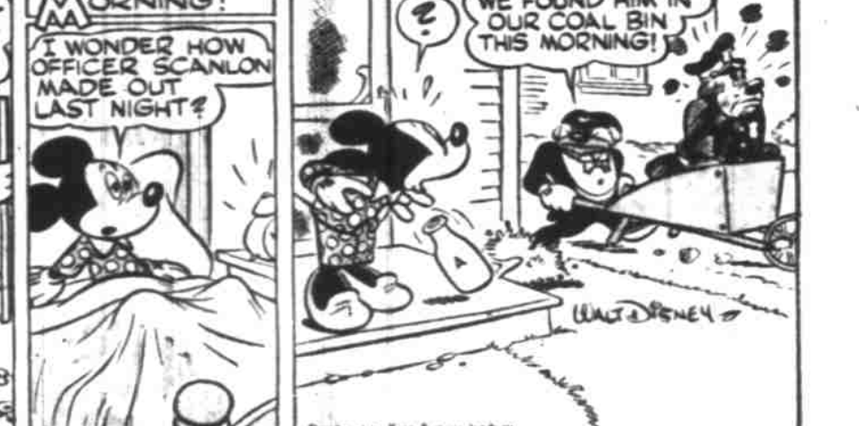
THE YOUNG IDEA