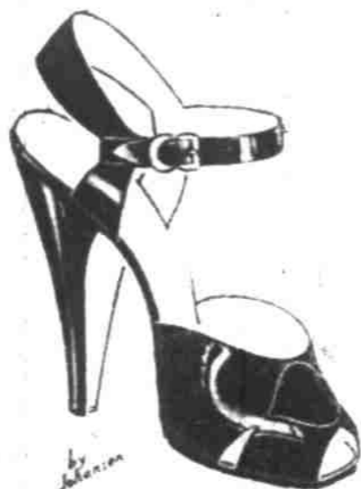
"Pixie No. 2" . . . Another Johansen . . . of shining patent leather . . . or black lizard . . . an extremely "naked sandal" . . . the heel is very high . . . 9.95