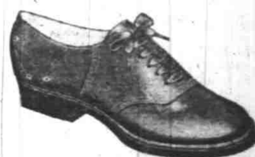
"Saddle" . . . Tan and white . . . this new saddle has the lowest low heel . . . you ever saw . . . smooth leather . . . 6.95