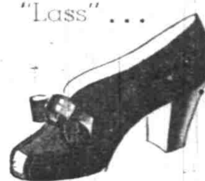
"Lass" . . . Gabardine . . . in black or navy . . . a new version of the v-throat pump . . . the heel is medium . . . 8.95