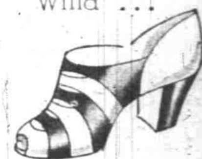
"Willa" . . . Again it's gabardine . . . cuban heel . . . closed back . . . reinforced arch . . . combination last . . . 8.95