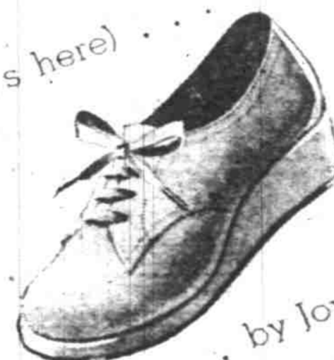
"Alert" . . . by Joyce . . . The "number one favorite" of thousands . . . yes . . . it's the broad white Joe Alert . . . in snow . . . 6.50