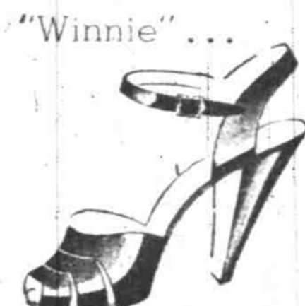
"Winnie" . . . Forstman's all wool black gabardine sandal . . . also in patent leather . . . 8.95