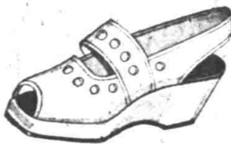
"Sabot" . . . Again by Pacific . . . this sabot is of white elk or blonde saddle tan . . . famous cushion wedge . . . 5.95