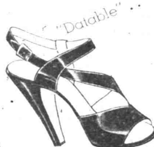
"Datable" . . . Who else but Johansen? gleaming black patent . . . of extreme high heel . . . it's the new "Naked Genius" . . . of ex . . . 9.95