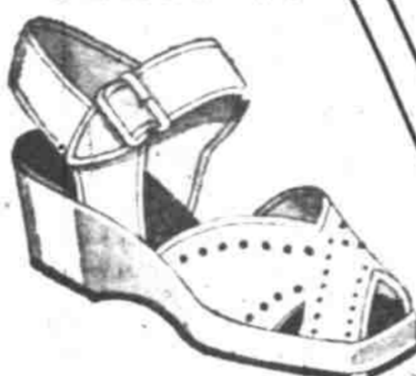
"Pacific" . . . White elk . . . or blonde saddle tan . . . it's Pacific's cushion sole wedge . . . (also in narrow widths . . . 5.95