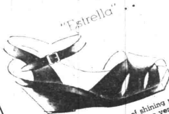
"Estrella" . . . It's lling again . . . of shining patent leather . . . a one strap version wedge' . . . with the new "skeleton" . . . 7.95