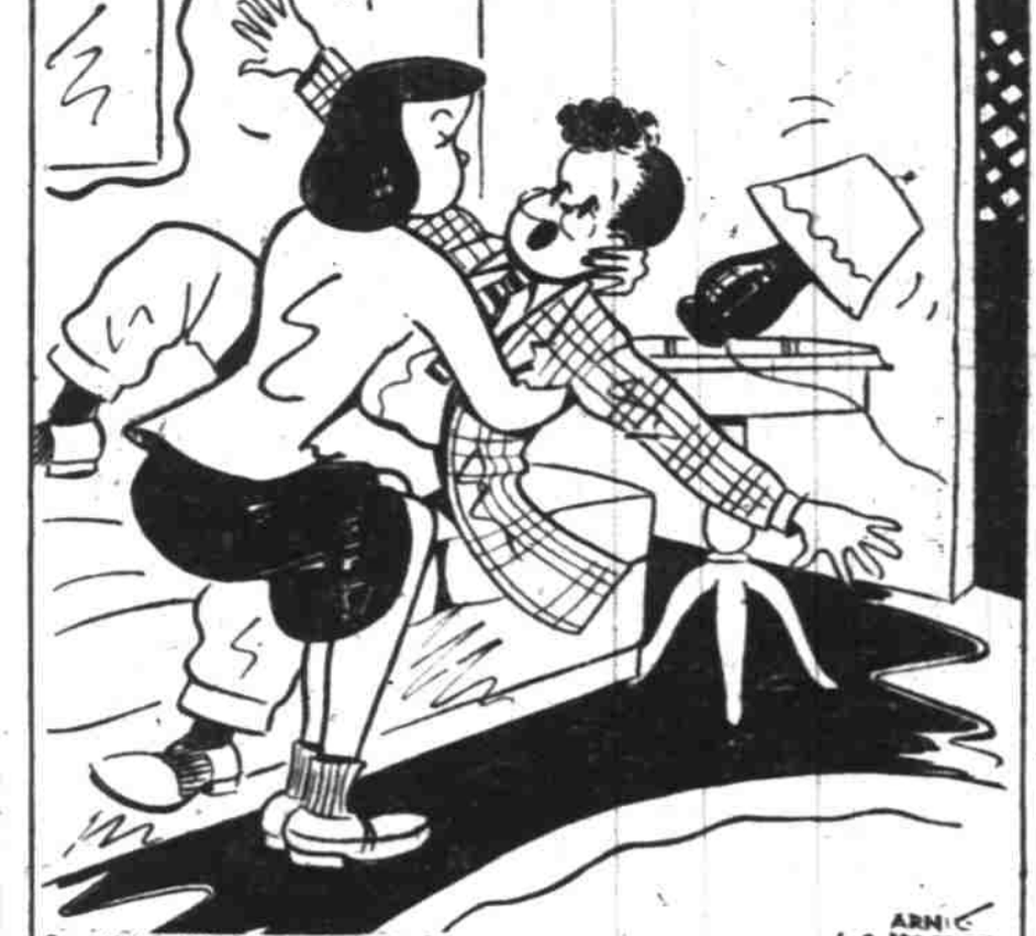
Copyright 1944 by United Feature Syndicate, Inc. "Donna, you'll just have to cancel your subscription to 'Super Love Stories,' that's all!"