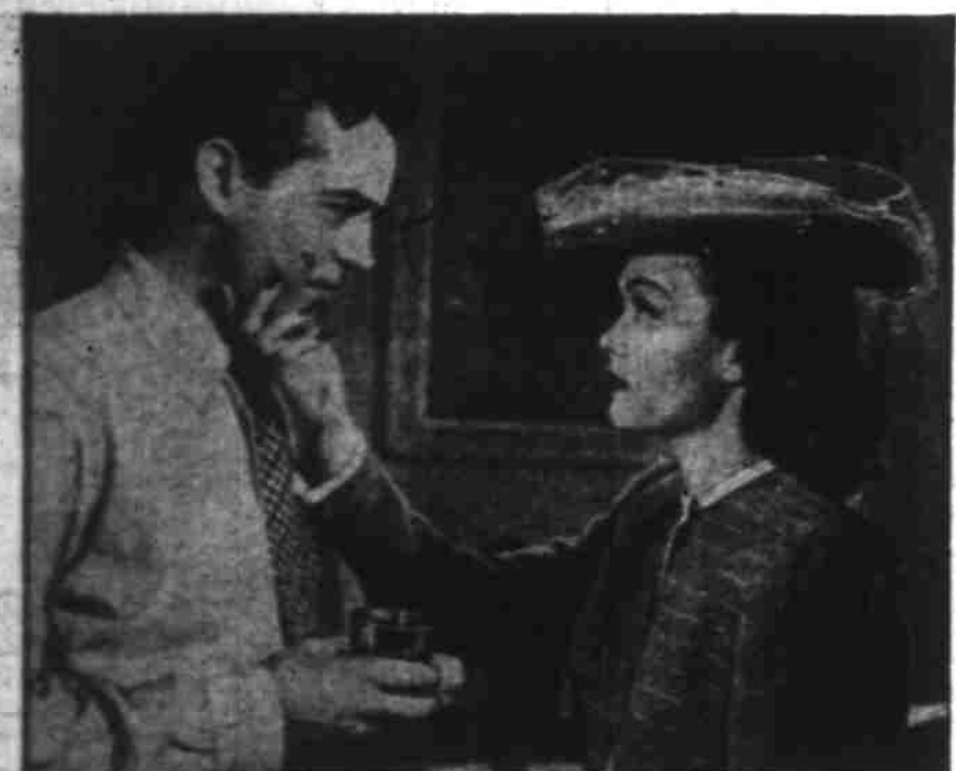
Never did a romance flower under more terrifying circumstances than did the lovers of Paramount's unusual drama, "The Lost Weekend," picture of Charles Jackson's best-seller, now showing at the Elsinore Theatre. Ray Milland and Jane Wyman, shown here, co-star in the film.