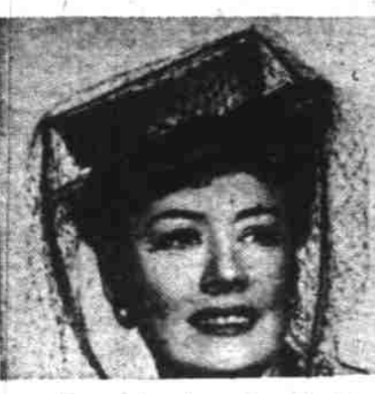
Irene Dunne is starred with Alexander Knox and Charles Coburn in the comedy hit "Over 21," now playing at Warner's Capitol theatre.