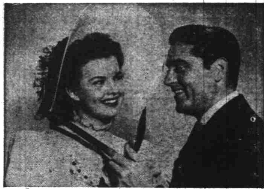
Phil Regan doesn't mind trying the bonnet of his heart interest, Gale Storm, in the season's gay musical, Monogram's "Sunbonnet Sue," currently at the Grand theatre. The two co-star in the tuneful revival of many of the songs of Gus Edwards and other favorites.

HOLLYWOOD Cont. From 2:00 P.M. GEORGE RAFT-CLAIRE TREVOR SIGNE HASSO JOHNNY ANGEL Co-Feature Leon Errol "MAMA LOVES PAPA"