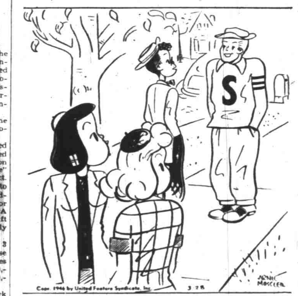
"Sometimes I'm inclined to think I should trade Buford in for a new model!"