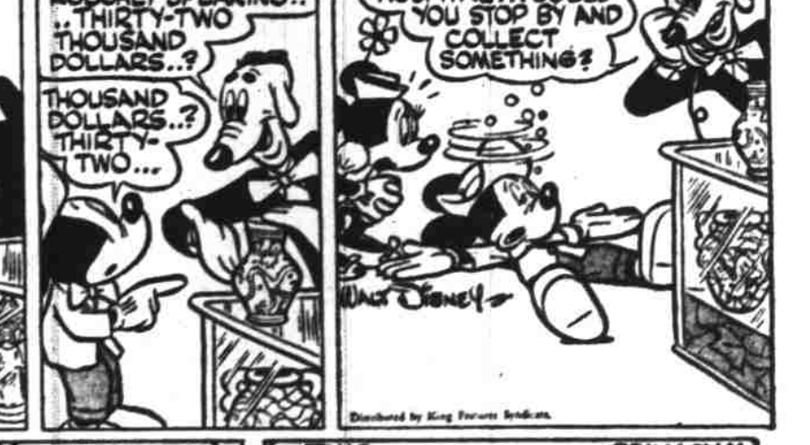
I WANT TO START A COLLECTION... HERE'S A VERY FINE SPECIMEN...