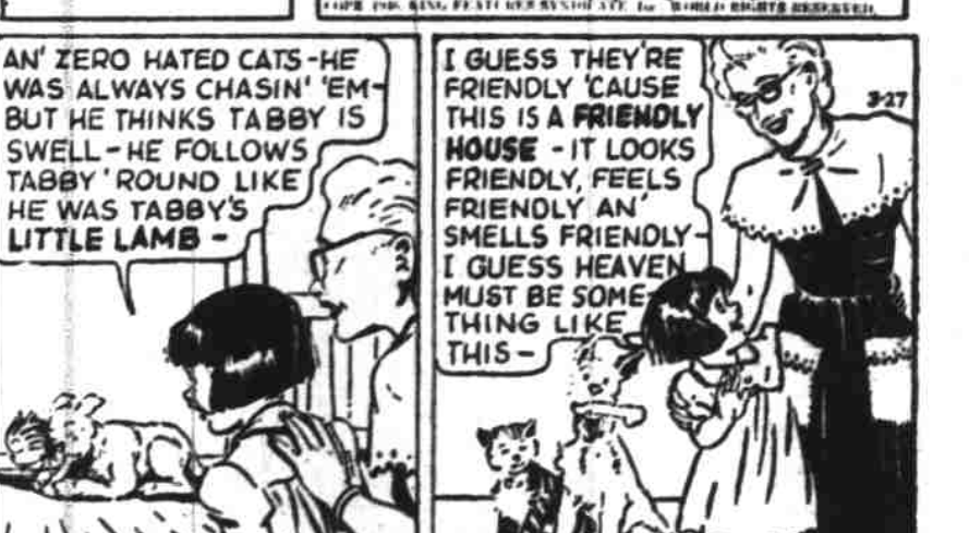
AN' ZERO HATED CATS-- HE WAS ALWAYS CHASIN' 'EM BUT HE THINKS TABBY IS SWELL-- HE FOLLOWS TABBY 'ROUND LIKE HE WAS TABBY'S LITTLE LAMB.