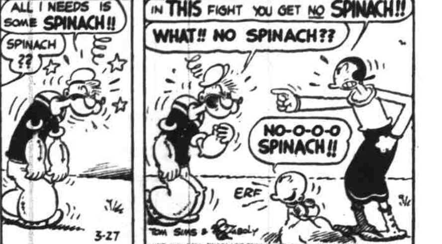
POPEYE, ARE YOU ALL RIGHT?? ALL I NEEDS IS SOME SPINACH!!