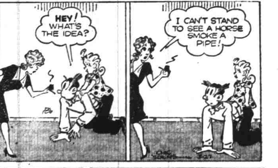
HE! WHAT'S THE IDEA? I CAN'T STAND TO SEE A HORSE SMOKE A PIPE!