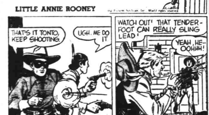
THAT'S IT TONTO, KEEP SHOOTING. UGH, ME DO IT.