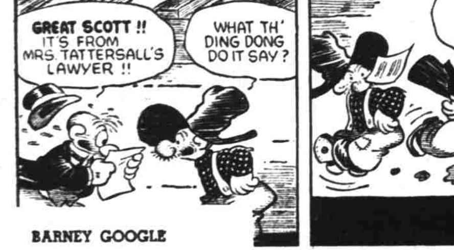
GREAT SCOTT!! IT'S FROM MRS. TATTERSALL'S LAWYER!!