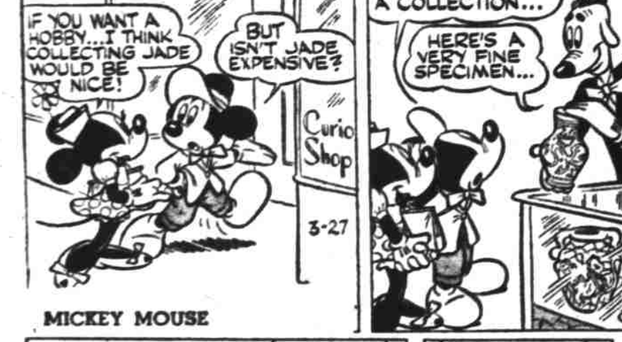
IF YOU WANT A HOBBY... I THINK COLLECTING JADE WOULD BE NICE!