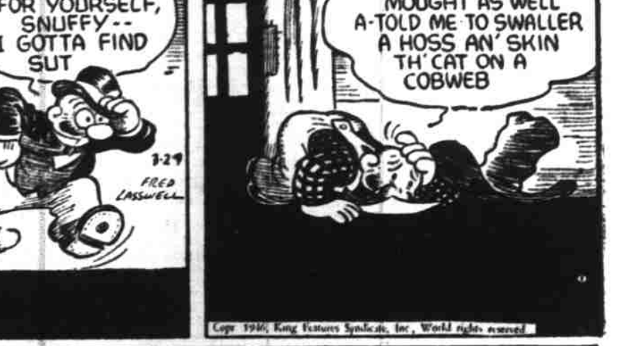
READ IT FOR YOURSELF, SNUFFY-- I GOTTA FIND SUT. THAT DITTY GOOGLE MOUGHT AS WELL A-TOLD ME TO SWALLER A HOSS AN' SKIN TH' CAT ON A COBWEB.