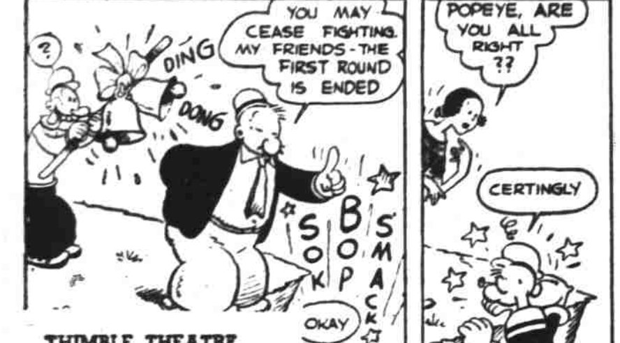
YOU MAY CEASE FIGHTING. MY FRIENDS-- THE FIRST ROUND IS ENDED.