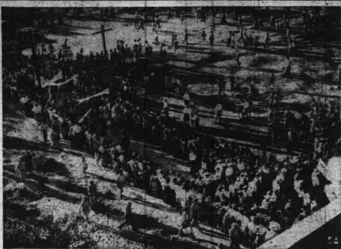
JEWISH DEMONSTRATION —A Jewish procession marches on Tel-Aviv for a demonstration after holding a mass meeting on the outskirts of the city, focal trouble spot.

Too Late to Classify FURNITURE for sale: Elec. stove, walnut dining suite, bdrm. suite, draperies. Phone 2-1566.