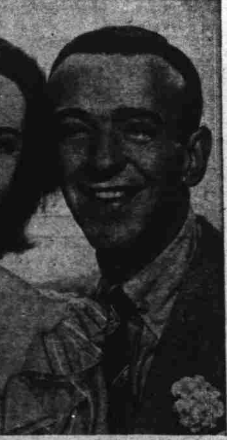
Lovely Lucille Bremer and Fred Astaire, appearing in the South American dancing musical "Tolando and the Thief" in brilliant technicolor, and starting tomorrow at the Grand.