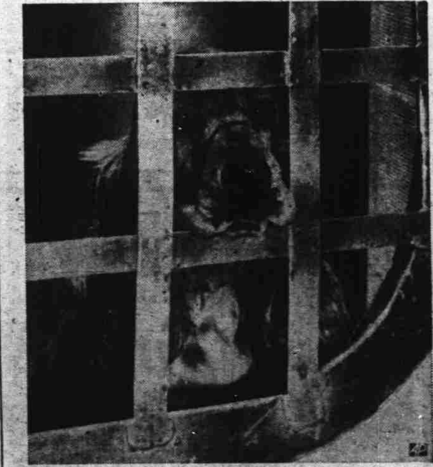
'STOWAWAY' IN BRIG —Capriccio, cocker spaniel, peers from behind bars in brig of USS Boise after being smuggled aboard ship by a GI, Seymour Gellman of Brooklyn.