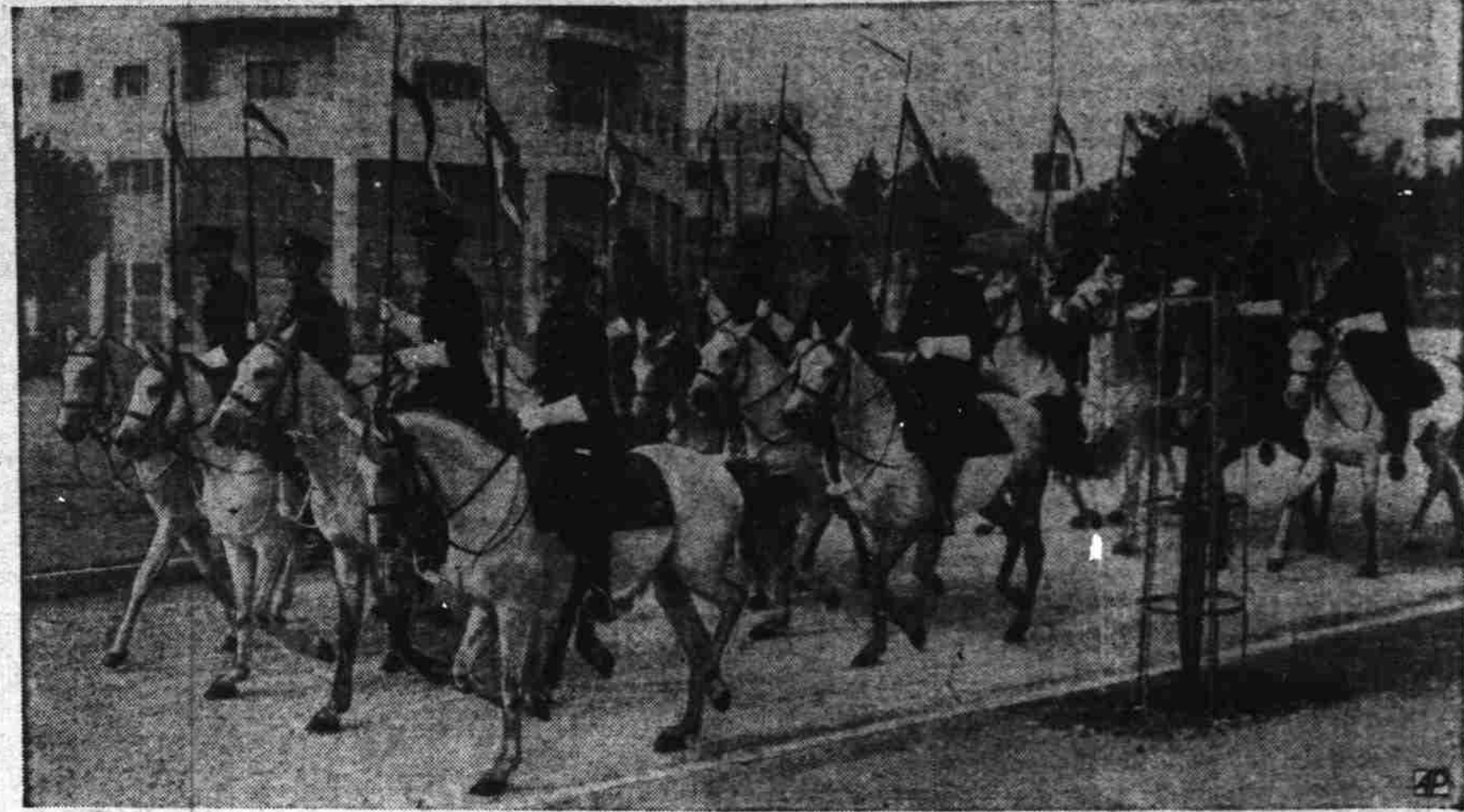
PALESTINE POLICE PARADE —Mounted police parade past the public information office at Lydda, Palestine, when Lt. Gen. Sir Alan Cunningham arrived by plane to take over as high commissioner for Palestine and Transjordan.