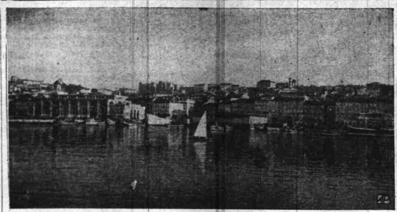
DISPUTED CITY—This is a recent view of Trieste, main coastal city of the Allied occu-pation zone of northeastern Italy, to which both Yugoslavia and Italy have laid claim.

From The Statesman's Community Correspondents