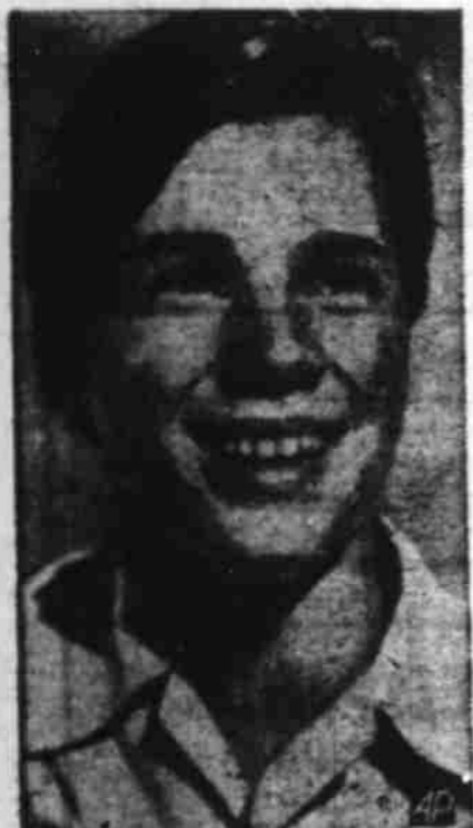
VETERAN —Although he's just 14 years old, Darryl Hickman is celebrating his tenth anniversary in the movies.