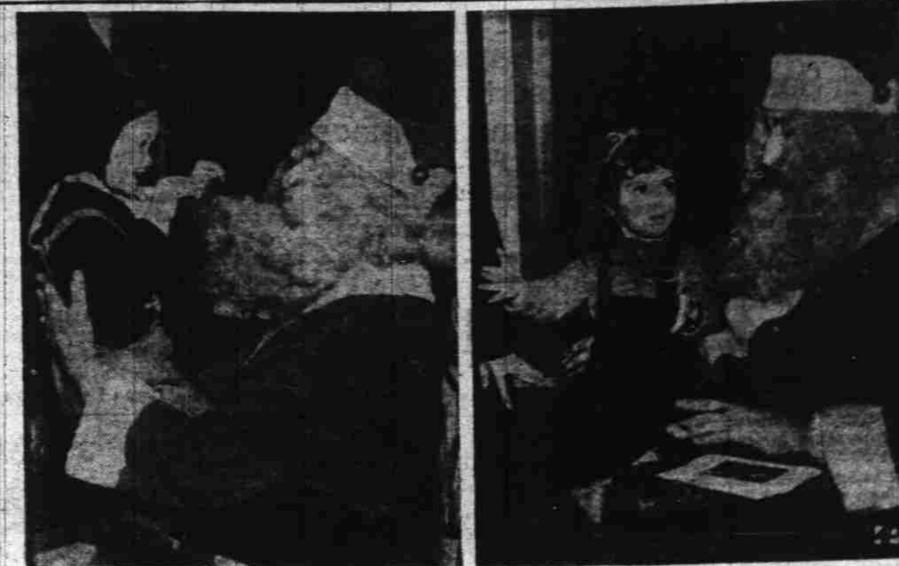
SANTA'S TROUBLES —A little girl (right) tells Santa Claus she wants a doll as "big as that." Tot at left is more intent on playing with whiskers than talking about toys.

ICE CREAM 23c Qt. SAVING CENTER Salem & West Salem