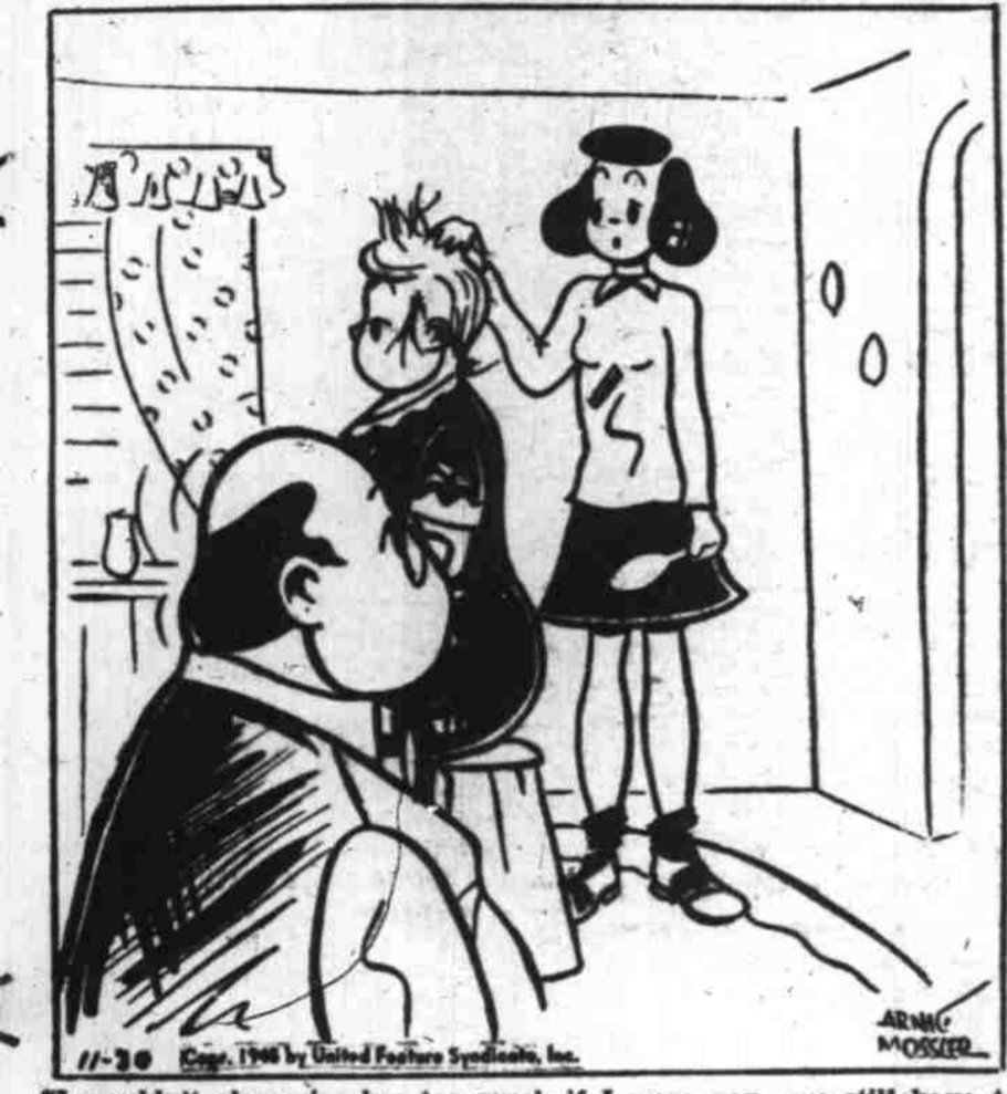
"I wouldn't glamorize her too much if I were you—we still have to live with her, you know!"