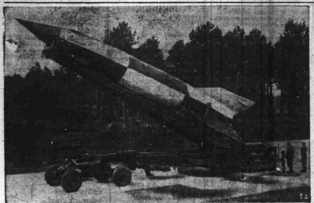
TESTING V-2 ROCKET-A V-2 rocket is shown being elevated to vertical firing posi-tion by British scientists during tests of the Nati weapon at Cuxhaven, Germany.