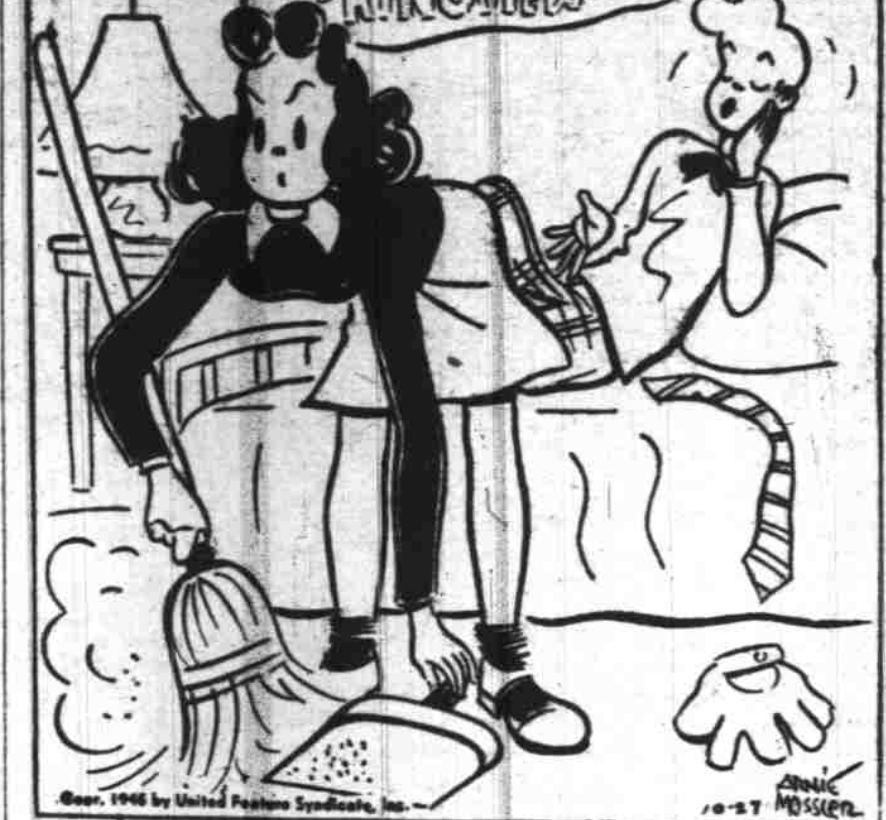
So if my room is tidied up, mom'il let me out tonight, and I'll be able to keep our date-see, pigeon?"