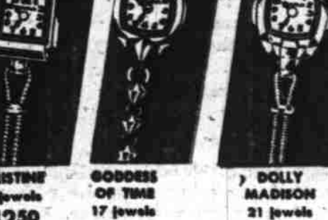
(All watch prices include tax)