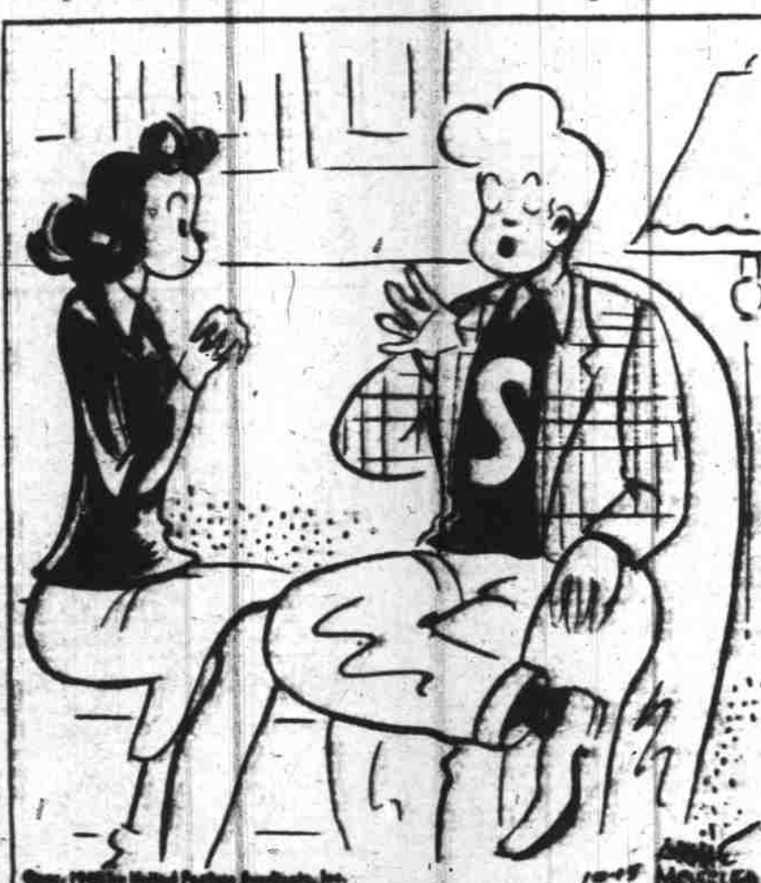
"Guess there isn't much in this old world I haven't seen or done—from jittersburging to playing swing drums!"