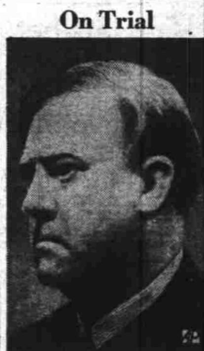
Major Vidkun Quisling, on trial for treason in Norway, pleads innocent to charges that he accepted gold from Hitler, yesterday.