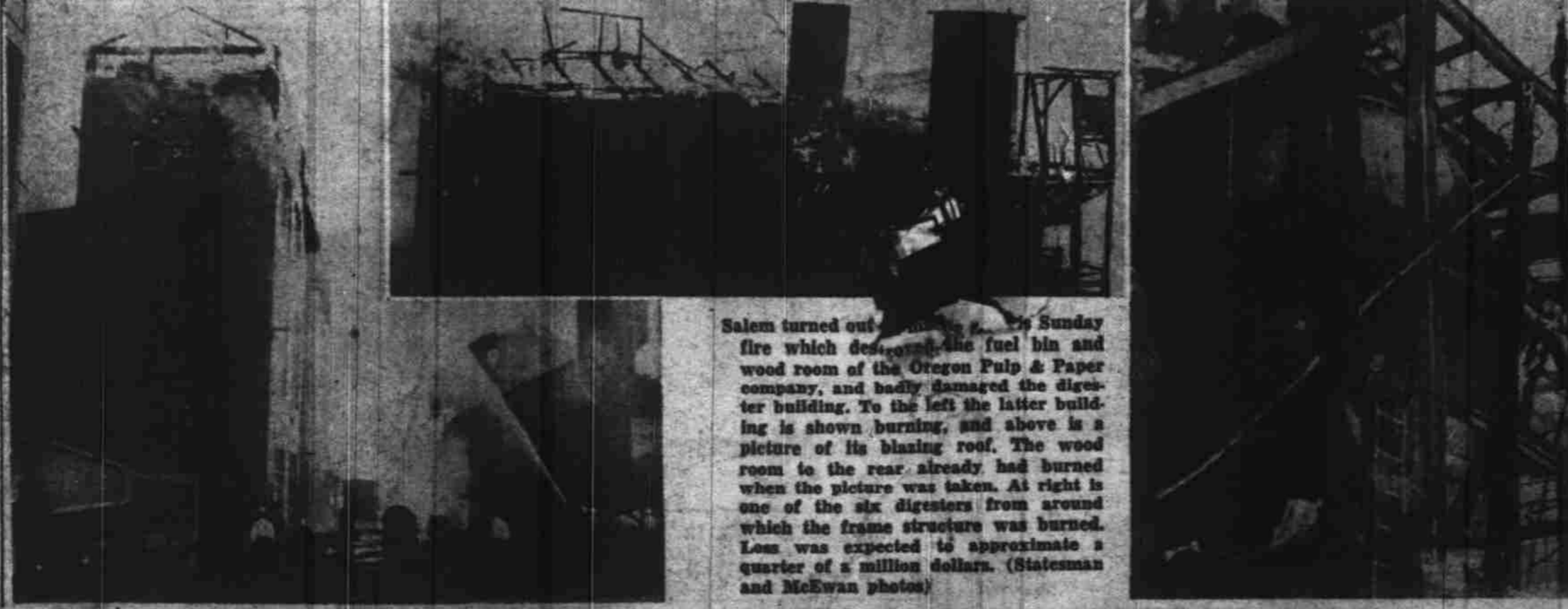
Salem turned out today to witness a Sunday fire which destroyed the fuel bin and wood room of the Oregon Pulp & Paper company, and badly damaged the digester building. To the left the latter building is shown burning, and above is a picture of its blazing roof. The wood room to the rear already had burned when the picture was taken. At right is one of the six digesters from around which the frame structure was burned. Loss was expected to approximate a quarter of a million dollars.