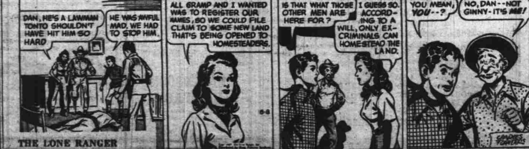
THE LONE RANGER