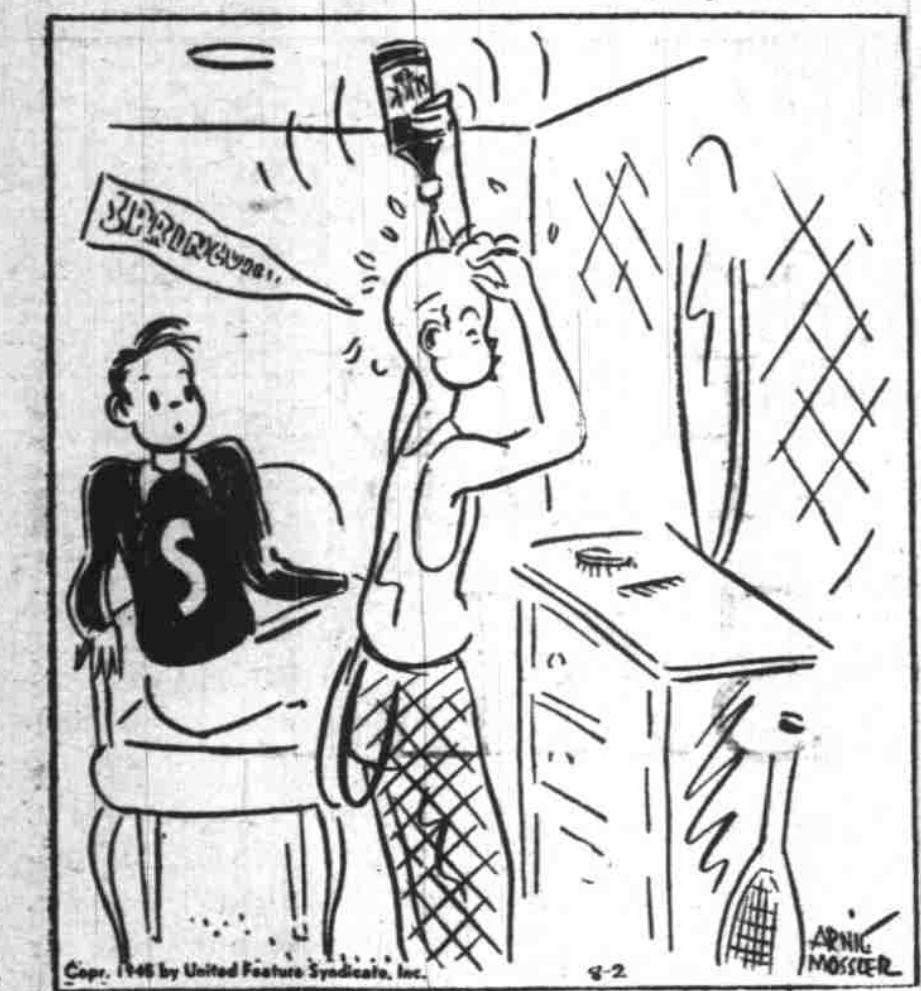
"This stuff kills the chicks in a subtle, tantalizing manner!"