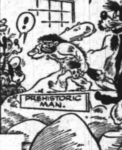
IT ACTUALLY IS BECOMING QUITE UNSAFE AROUND HERE