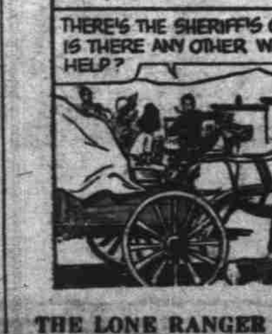
THE LONE RANGER