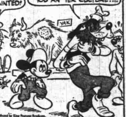
OH, NO! IF YOUR SCHEME FAILS, I ONLY LOSE MY JOB AND A BOY FRIEND WHO MAKES $10,000 A WEEK!