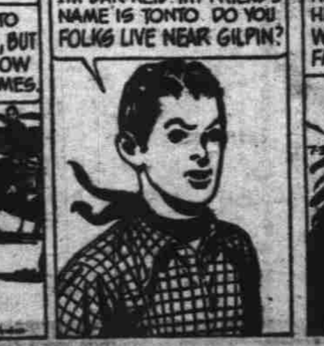
THE LONE RANGER