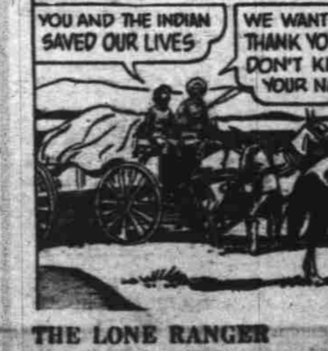
THE LONE RANGER