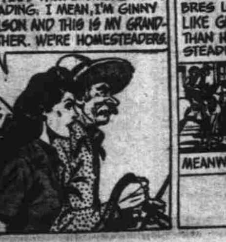
THE LONE RANGER