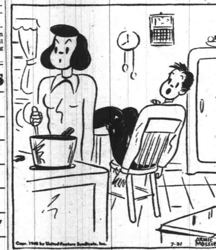
"Shall I get out teaspoons or tablespoons for the fudge?"