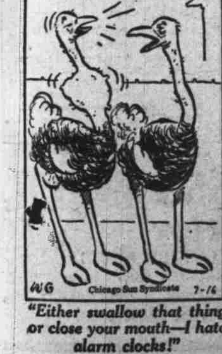
"Either swallow that thing or close your mouth—I hate alarm clocks!"