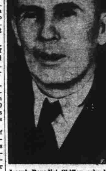
Joseph Benedict Chifley, who has been named prime minister of Australia in caucus balloting for a successor to the late John Curtin.