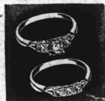
Exquisite Diamond and Wedding Ring... 103.50