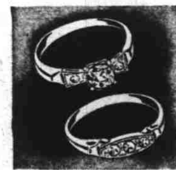
Brilliant Diamond and Wedding Ring... 69.50