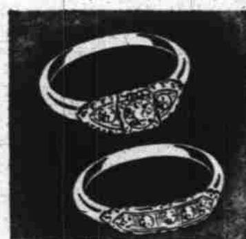
Ornate Engagement and Wedding Ring... 110.00