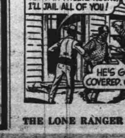
THE LONE RANGER