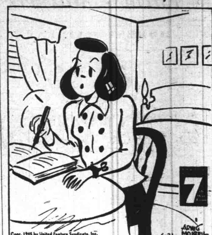
Cap. 1945 by United Features Syndicate, Inc.

"Dear Diary—Had my first kiss tonight (with the exception of the folks and sundry relatives, of course) and frankly, it was a tremendous bringdown!"