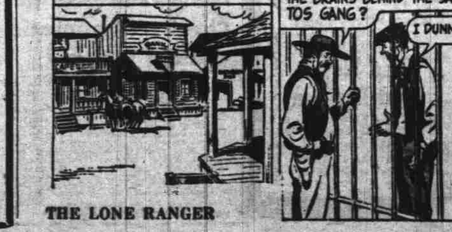
THE LONE RANGER