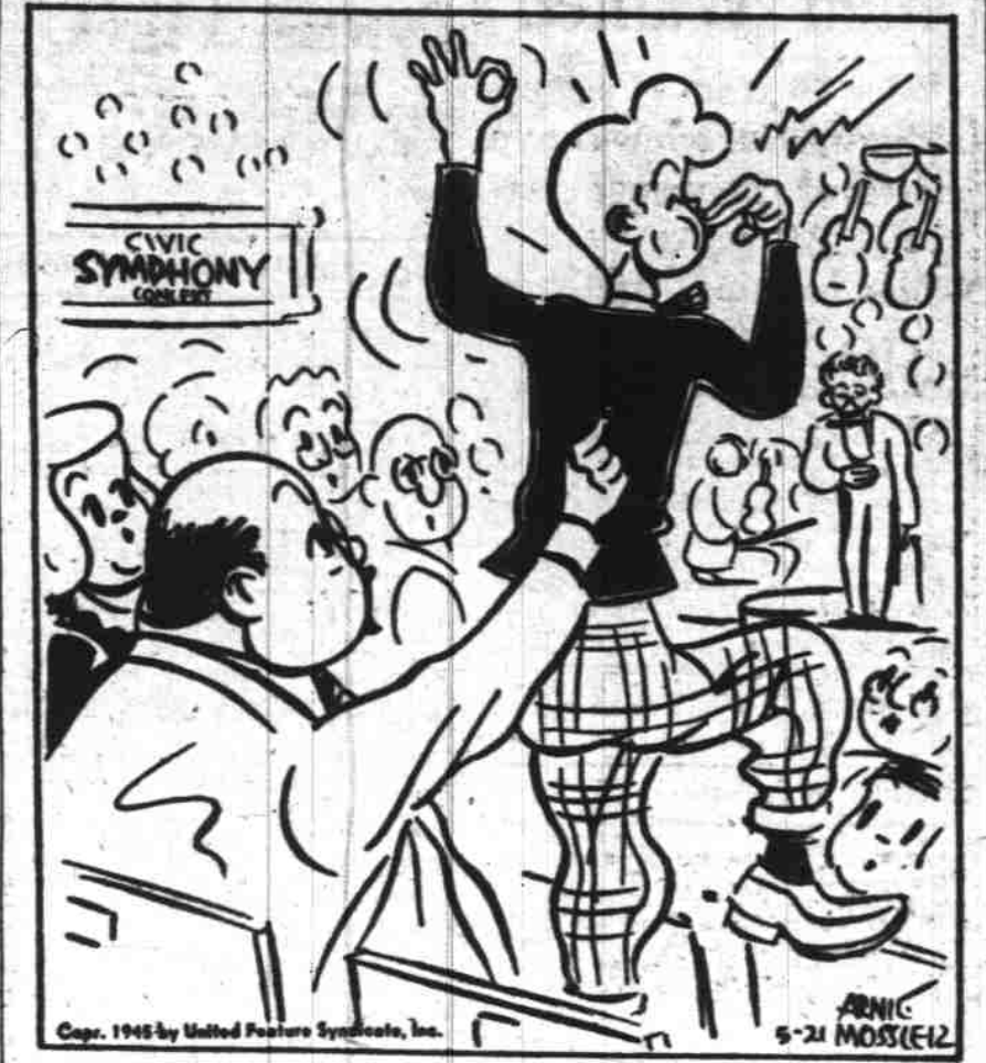
"Shahh! You don't applaud the same way here as you do for swing bands, son!"