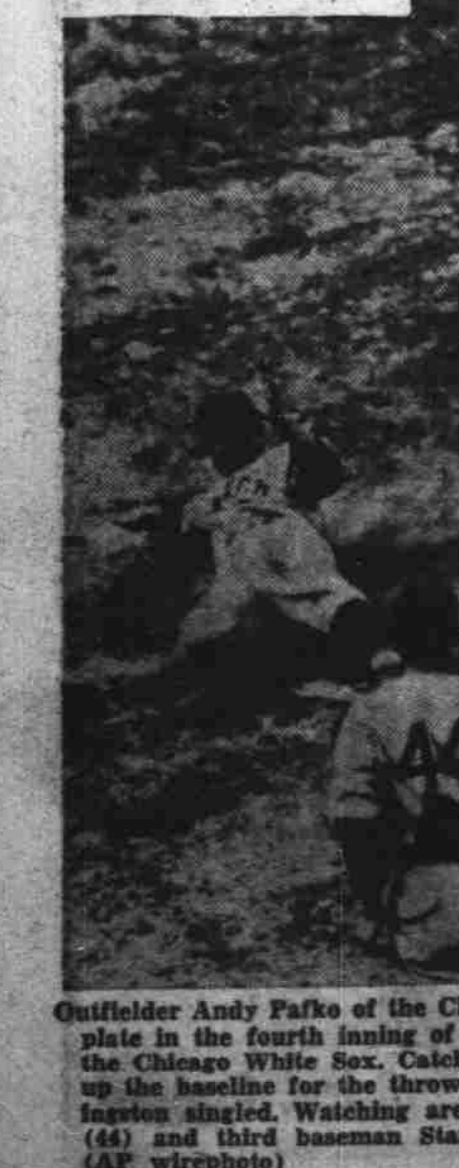
Outfielder Andy Pafko of the Chicago Cubs slides safely across home plate in the fourth inning of an exhibition game in Chicago with the Chicago White Sox. Catcher Mike Tresh of the Sox (15) runs up the baseline for the throw from center field after Mickey Livingston singled. Watching are Cubs first baseman Phil Cavaretta (44) and third baseman Stan Hack (25). The Cubs won, 15-3.