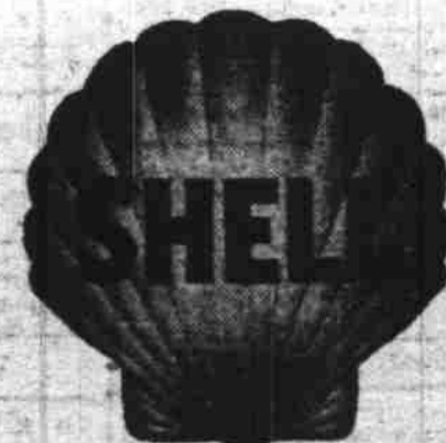
Care for your Car for your Country

IT'S TIME TO CHANGE TO GOLDEN SHELL MOTOR OIL! Warm weather will soon be here. Be sure your oil is clean, summer-grade Golden Shell for fullest protection against wear. SHELL OIL COMPANY, Incorporated.