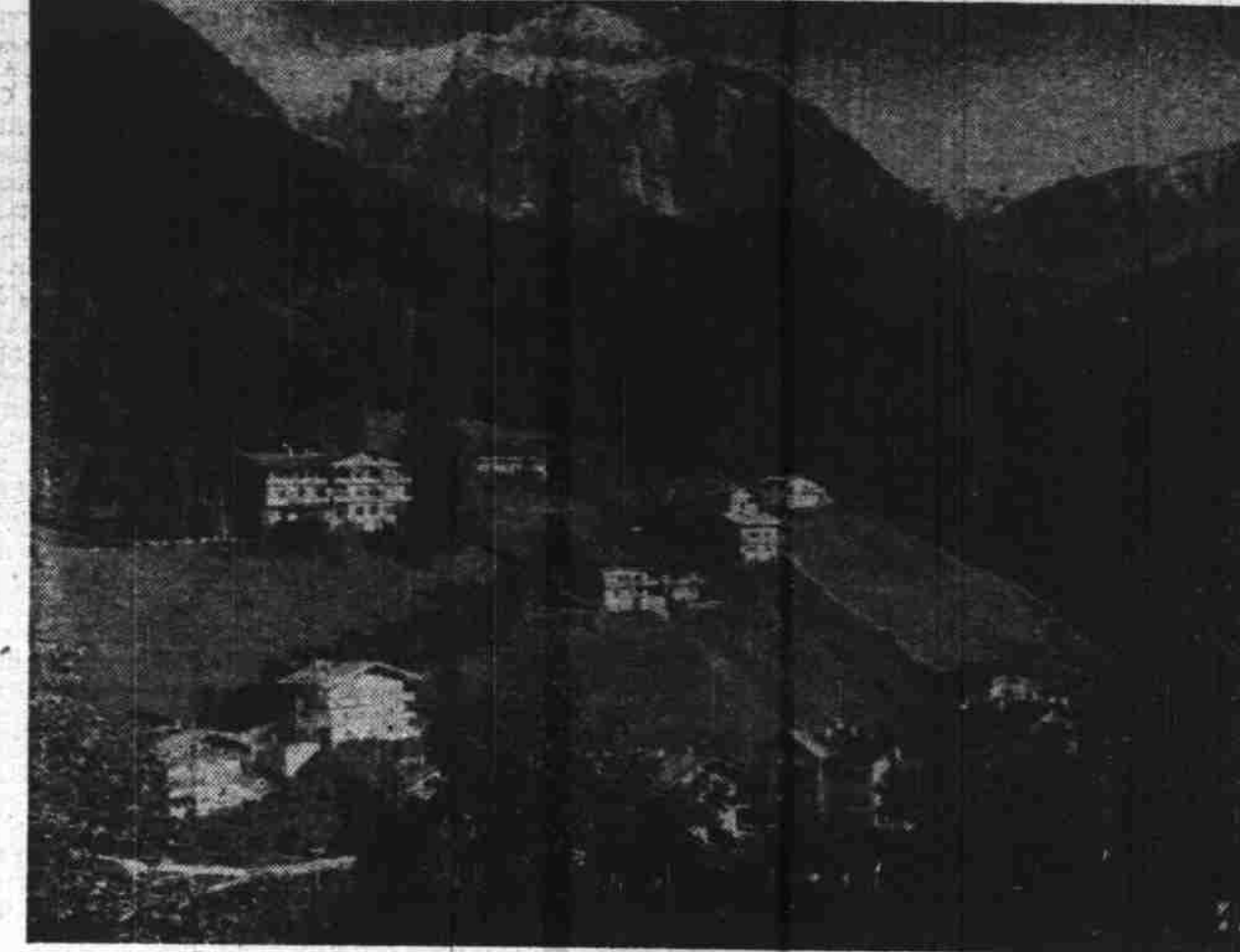
BERCHTESGADEN VILLAS-Mountain villas nestle against the slope at the edge of the town of Berchtesgaden, in southern Germany, near Hitler's Berghof hideaway.