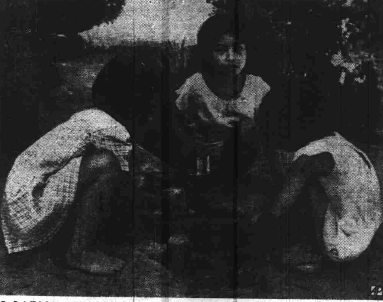
C-RATION MOULDS - Using C-ration cans as moulds Filipino children make mud pies during a school recess. Picture was made at Manaoag, Luzon, P. I.