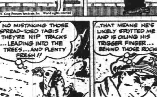
THEY'RE NIP TRACKS LEADING INTO THE TREES ... AND PLENTY