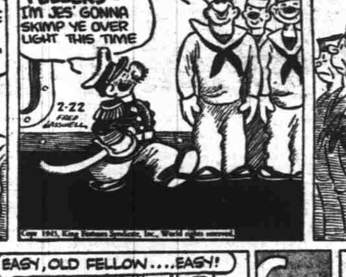
FLING THIS VARIVING N ARNS!! HE'S GOT ON YESTIDDY'S