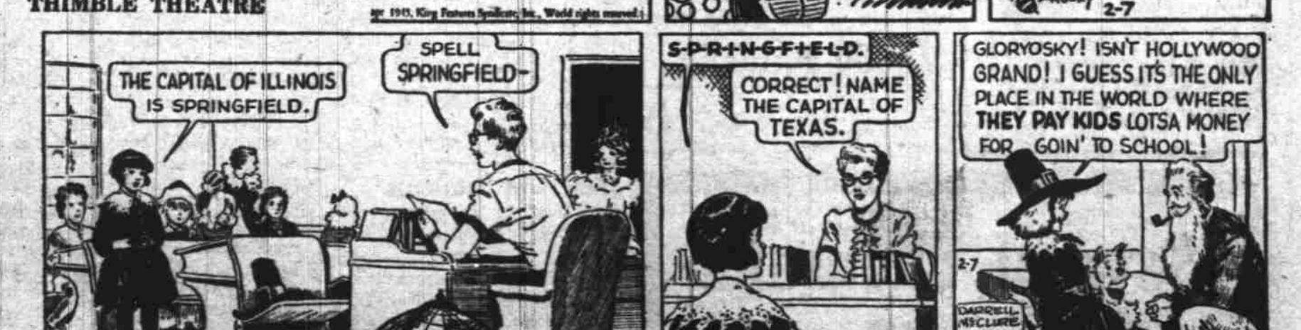
LITTLE ANNIE ROONEY