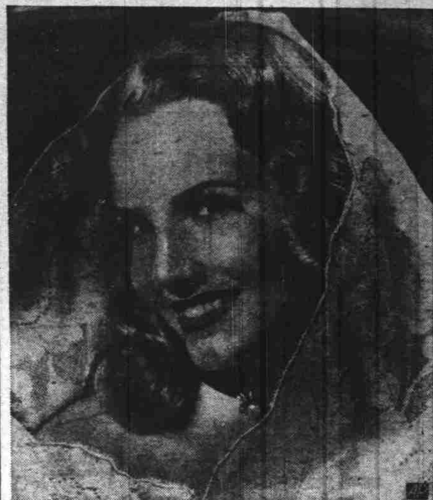
BEAUTY AND LACE — Janet Blair of the movies uses a white lace mantilla to frame her face for a camera study.