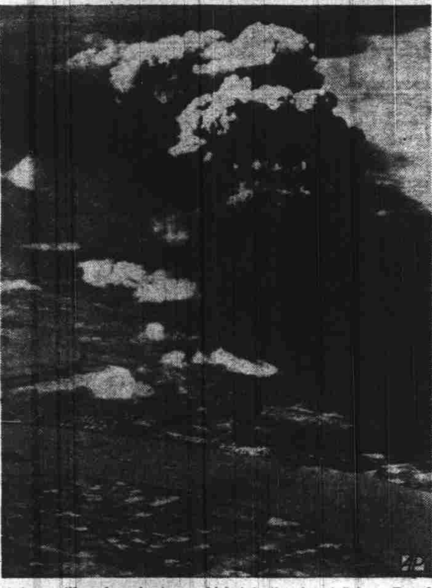
into Nazis defending the metrohuge pillar of smoke towers high into the sky at Saigon, French politan pocket by dominating the Indo-China, after a successful raid by carrier-based planes of the Third U. S. fleet.