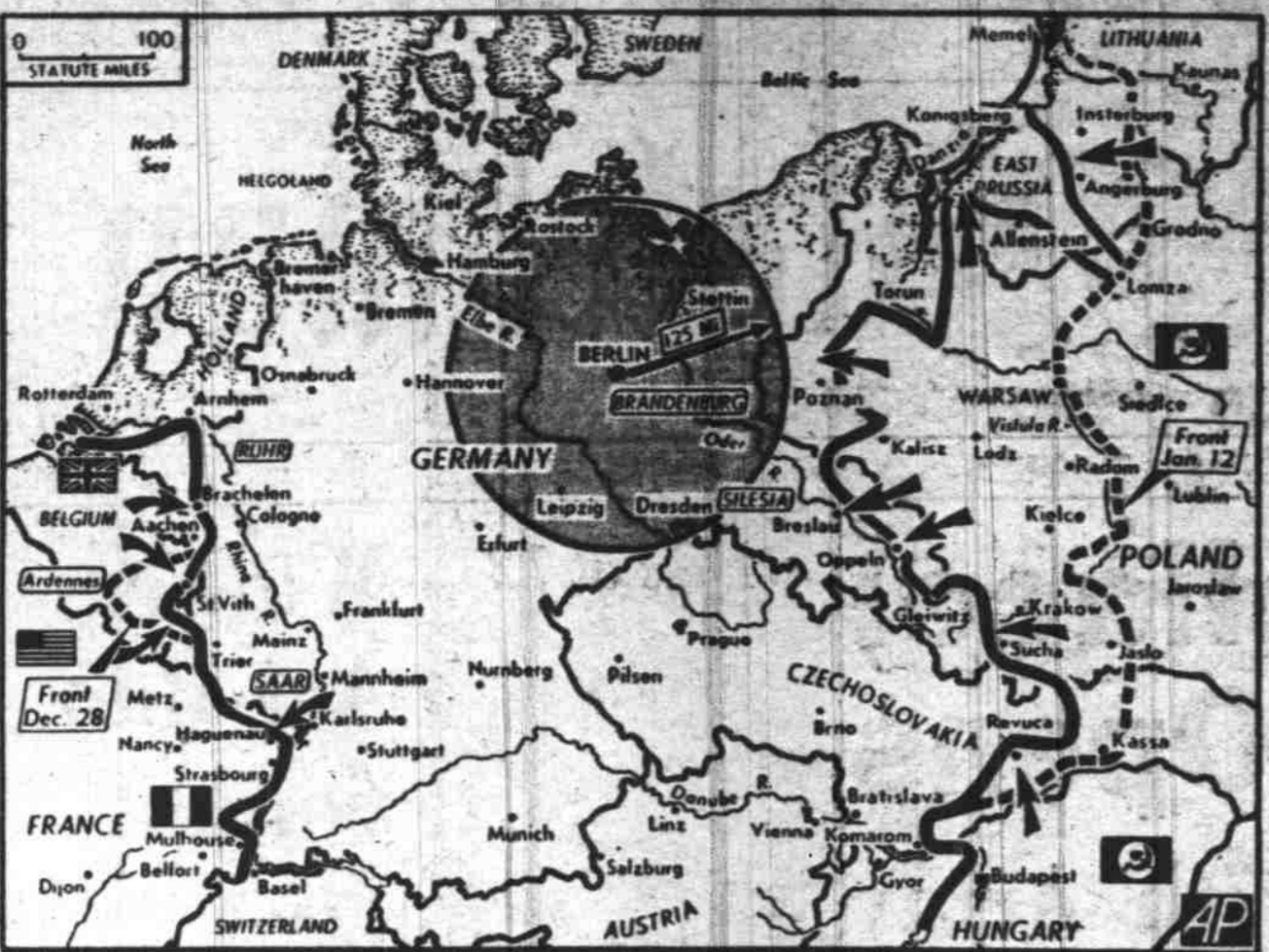
Arrows indicate action today on the eastern and western fronts in Europe (heavy lines). Russians, threatening Berlin itself from the area of Poznan, have cut off East Prussia in the north and are fighting along the Oder river in German Silesia to the south. On the western front British and Americans have advanced north of Aachen, and a German offensive north of Strasbourg has been checked. Shaded circle centered on Berlin has a radius of 125 miles.