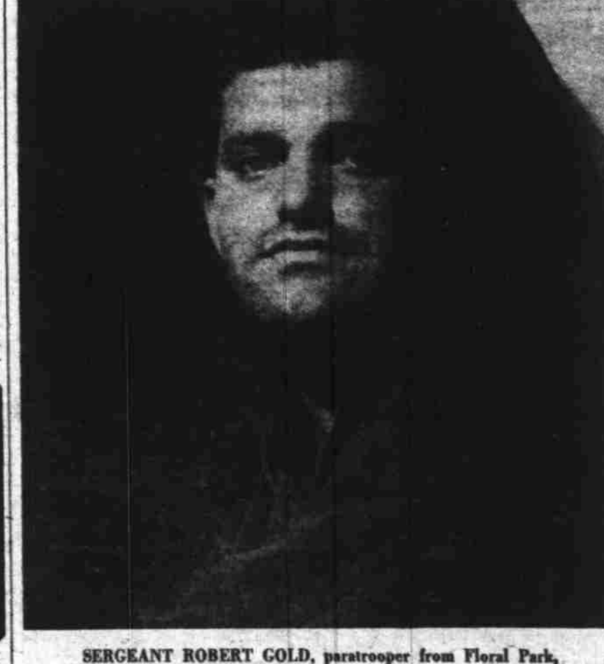
Long Island, New York

"I was on a 10-man patrol that penetrated two miles behind the enemy lines in Italy. We walked right into an ambush. The Jerries opened up on us from a group of houses. They poured it into us with machine guns, rifles, and mortars. Only five of us got back. I was his in the right shoulder by a 'burp gun' — a German machine pistol. They took me to an evacuation hospital on the beach at Anzio. The hospital was shelled the second day I was there. I'd just been operated on. My tent was full of amputation cases, some of them pretty bad. When the shells started falling it was pretty tough. Two nurses were killed. But the other nurses—they just kept right on working through the shelling. They were just kids, most of them, and they didn's seem to have enough help, but they had courage and skill enough to make up for anything else they lacked."