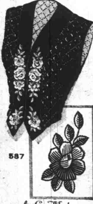
by Laura Wheeler

Don't let a fuel shortage scare you. Be warm and all dressed up, too, in this quilted weskit. So simple to quilt and embroider in wool. Quilting and wool embroidery make a luxurious weskit. Pattern 587 has transfer of embroidery; pattern; size 12, 14, 16; state size