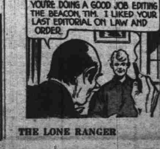
THE LONE RANGER