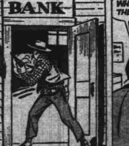
I'M SURRY THAT THAT ALL RIGHT-ME NOT HURT!