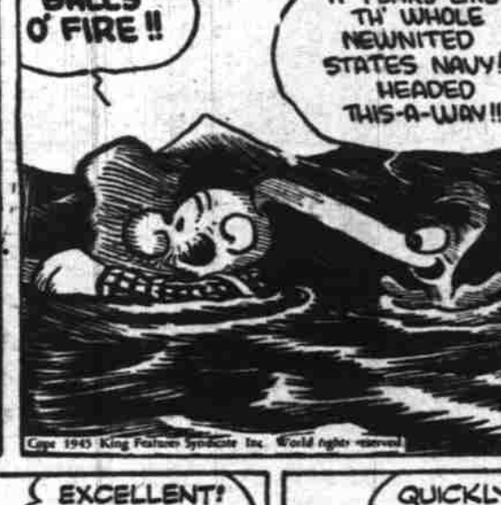
I KNOW'D TH' PRESIDENT WOULD MAKE TH' FUR FLM PERDICKERMINT .