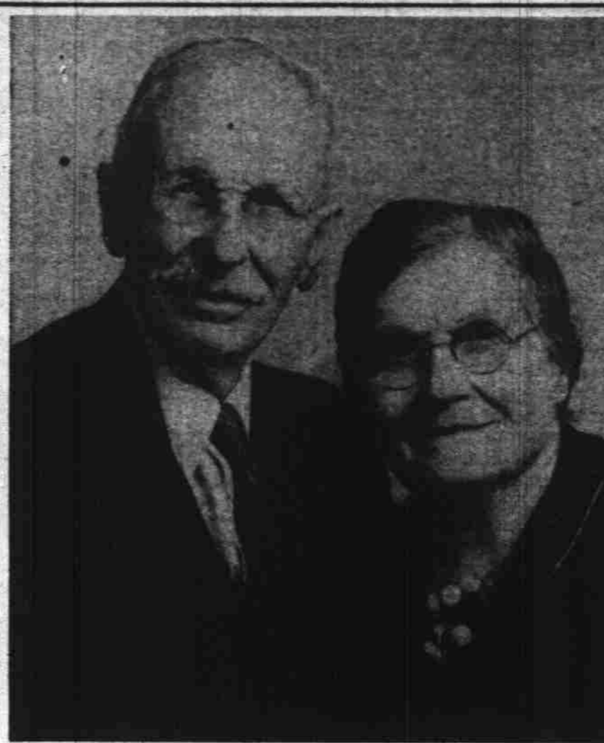
MARRIED 55 YEARS

STOVES: 45¢ at local OPA board for oil gas stove certificate.