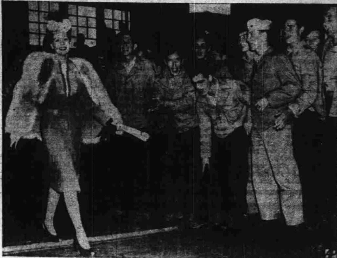
Battle weary marine veterans of Guadalcanal, Cape Gloucester, and Peleliu, who arrived at San Francisco, take a good look at film actress Marie Mac Donald, the first white woman many of them had seen in months. Judging by their expressions, the First marine division veterans enjoyed the view.