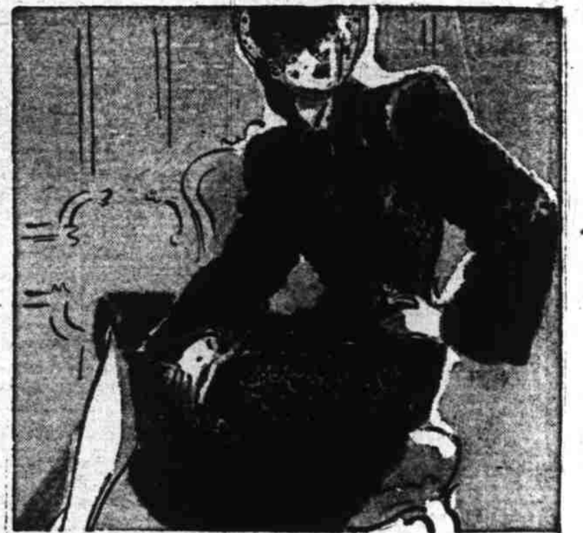
LUSTROUS PILE COATS 59.50

These Ward bargains are news all over town! For there's a coat for everyone at Wards... at a price that hardly seems possible. ALL WOOL suedes, ALL WOOL knit fleeces, cotton backed for extra long wear. Also wool-and-rayon combinations, in chesterfields, boy coats, flange fronts, fitted coats... all in brilliant and dark shades. Don't miss them! Use Wards Time Payment Plan!