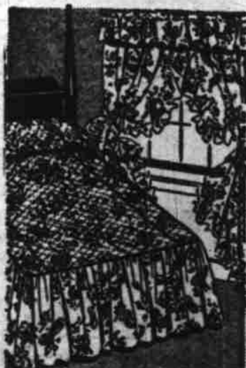
CHINTZ BEDROOM ENSEMBLE . . .

Beautiful traditional styling combined with rugged construction at a low Ward price! Solid hardwood frame, rich Walnut finish. Smart antique white, artificial leather upholstery. See III