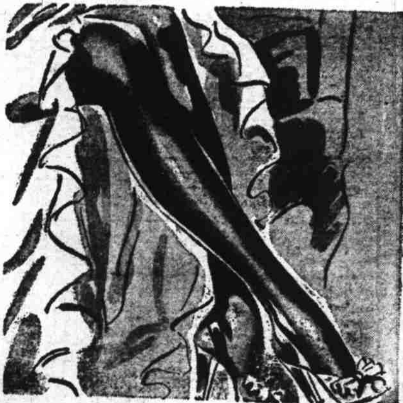
SEMI-SHEER RAYONS FOR ALL OCCASIONS pr. 81c

Give her a gift she'll be proud to wear. Wide selection of seal dyed coneys, beaver-dyed coneys, China mink dyed coneys, blue-fox dyed coneys, platinum dyed coneys. Handsomely lined.