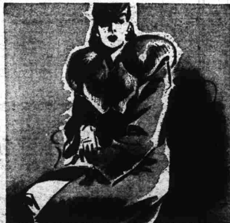
FINE FUR TRIMMED COATS EXCEPTIONAL VALUES AT $38

Here's the answer to a sweater girl's prayer! For what smart lass doesn't want her sweaters to be All Wool that's silky soft and yet so sturdy they'll stand up through seasons of tough wear? That's exactly the story of Wards new fall sweaters. We have two styles—a bulky knit slipon and a warm nubby slipon. (Once you see them, you'll want both). Pink, cherry, blue, green, purple, brown. 34-40.