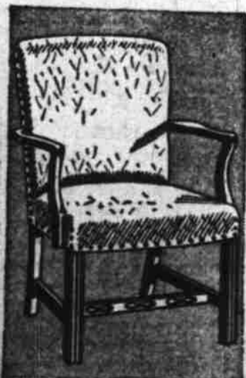
CHIPPENDALE OCCASIONAL CHAIR Only 20% Down! 16.95

Their fine Calness® rayon satin covering is unusually beautiful—and amazingly sturdy, too! It won't crack or split! Their lastingly soft, warm filling is 100% wool! Their stitching is hand guided and goes all the way through to the back—both sides are equally rich! Approximately 4 1/2 pounds. Cut size 72 x 84 inches. In stunning decorator colors. *Reg. U. S. Pat. Off.