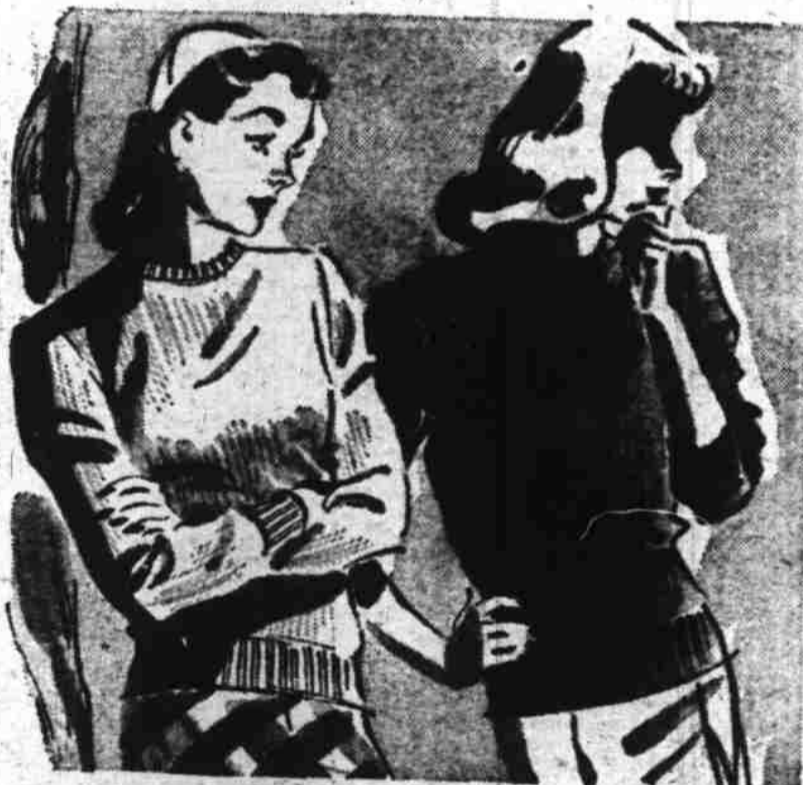
SWEATERS OF ALL WOOL — STURDY, BUT SO SOFT 5.78 6.59

Full fashioned stockings in semi-sheer weight that you can wear morning, noon and night! They're made of 100 denier rayon with reinforced tops and feet, and they're knit-to-cling so flatteringly to your legs! You can get them in smart new shades in sizes 8 1/2 to 10 1/2. Be sure to buy at least two pairs! Be sure too, that they are thoroughly dry before you put them on!