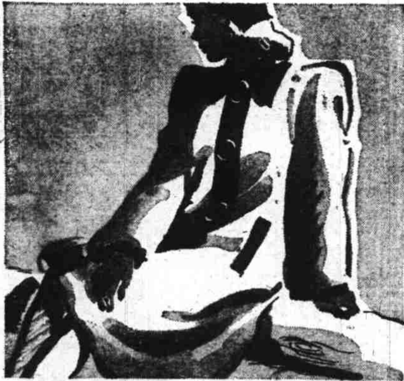
JAUNTY "TEDDY BEAR" FOR YOUNG IN HEART 24.75

The co-ed's own Teddy Bear coat of 100% wool alpaca is rapidly becoming a favorite with every miss! It's so young, such fun to wear, and so practical! Cuddle up in the fur-like warmth of the deeply napped alpaca. Look your gayest in white, brown or fawn with brilliant red or green border trim. You'll wear yours everywhere... from work to canteen parties. Sizes 10-18.