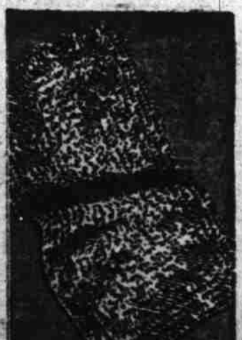
GIVE SOFT SHAGGY SCATTER RUGS 3.98

Practical . . . as well as pretty! For these sheer beauties are pyroxylin coated on both sides . . . absolutely waterproof! Floral prints in newest bathroom shades! Metal eyelet top! 68" x 72".